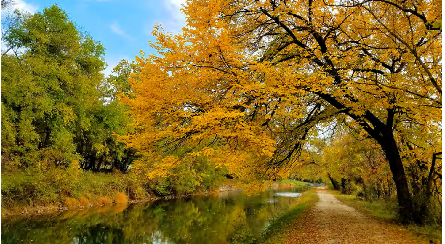
C&O Canal Towpath in Maryland