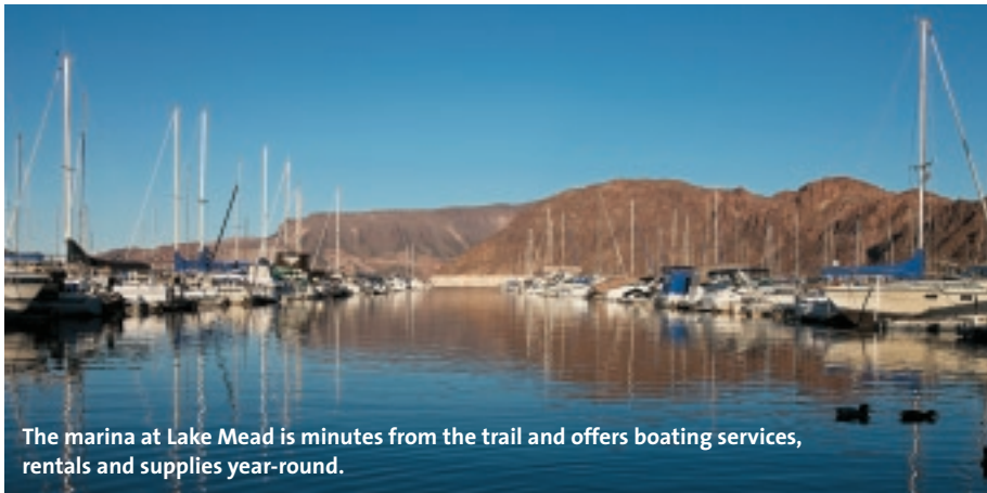
The marina at Lake Mead is minutes from the trail and offers boating services, rentals and supplies year-round.