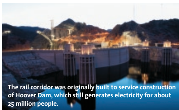
The rail corridor was originally built to service construction of Hoover Dam, which still generates electricity for about 25 million people.

After the fifth tunnel, the trail gets narrower and steeper as it slips down to the Hoover Dam Visitor Center. This steep portion is open only during daylight hours. The scenery here shifts from expansive lake views to power lines, storage sheds and electrical equipment related to the dam. Bicycles and dogs are prohibited at Hoover Dam, so people with their canine friends need to turn back when the trail reaches the parking structure. Bicyclists can leave their bikes at a bike rack next to the trail.