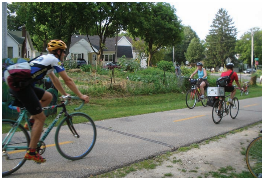
Capital City Trail, Wisconsin.