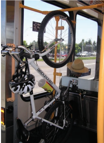
Bicycling is encouraged in Portland, Ore., where the city trams are equipped with bike racks.