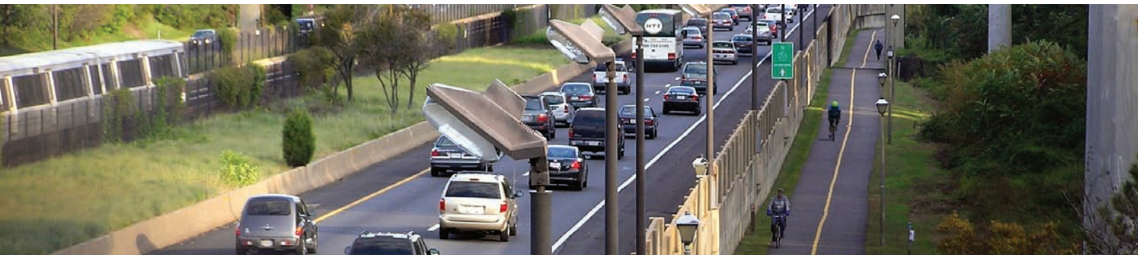
A crosssection of commuting in Arlington, Va., with subway, freeway traffic and trail travel.

Recent studies have shown that making communities more bike/pedestrian-friendly can make a significant contribution to overall greenhouse gas emissions