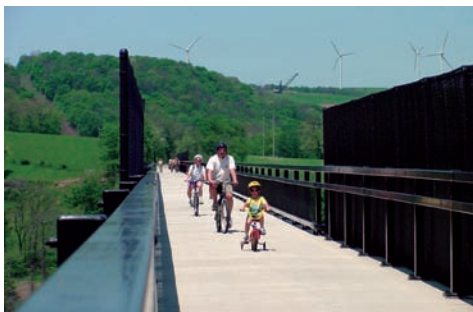
Beneath the wind mills of Garret Wind Farm a family cycles while energy is silently produced. Great Allegheny Passage, Pa.