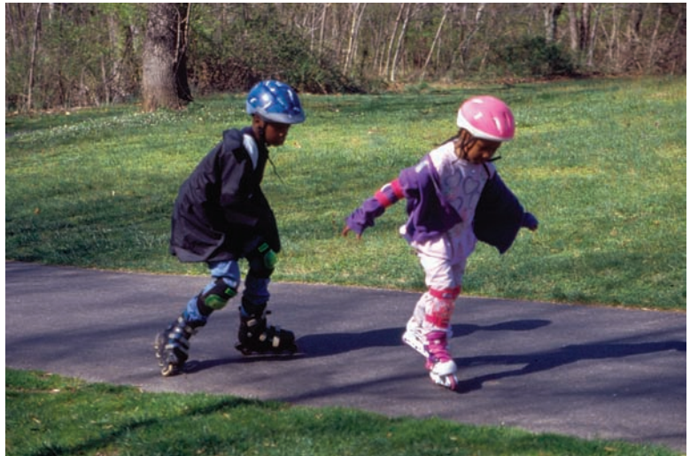
Two children learn and grow through the delight of skating in a safe and special place. Capital Crescent Trail, Washington, D.C., and Md.