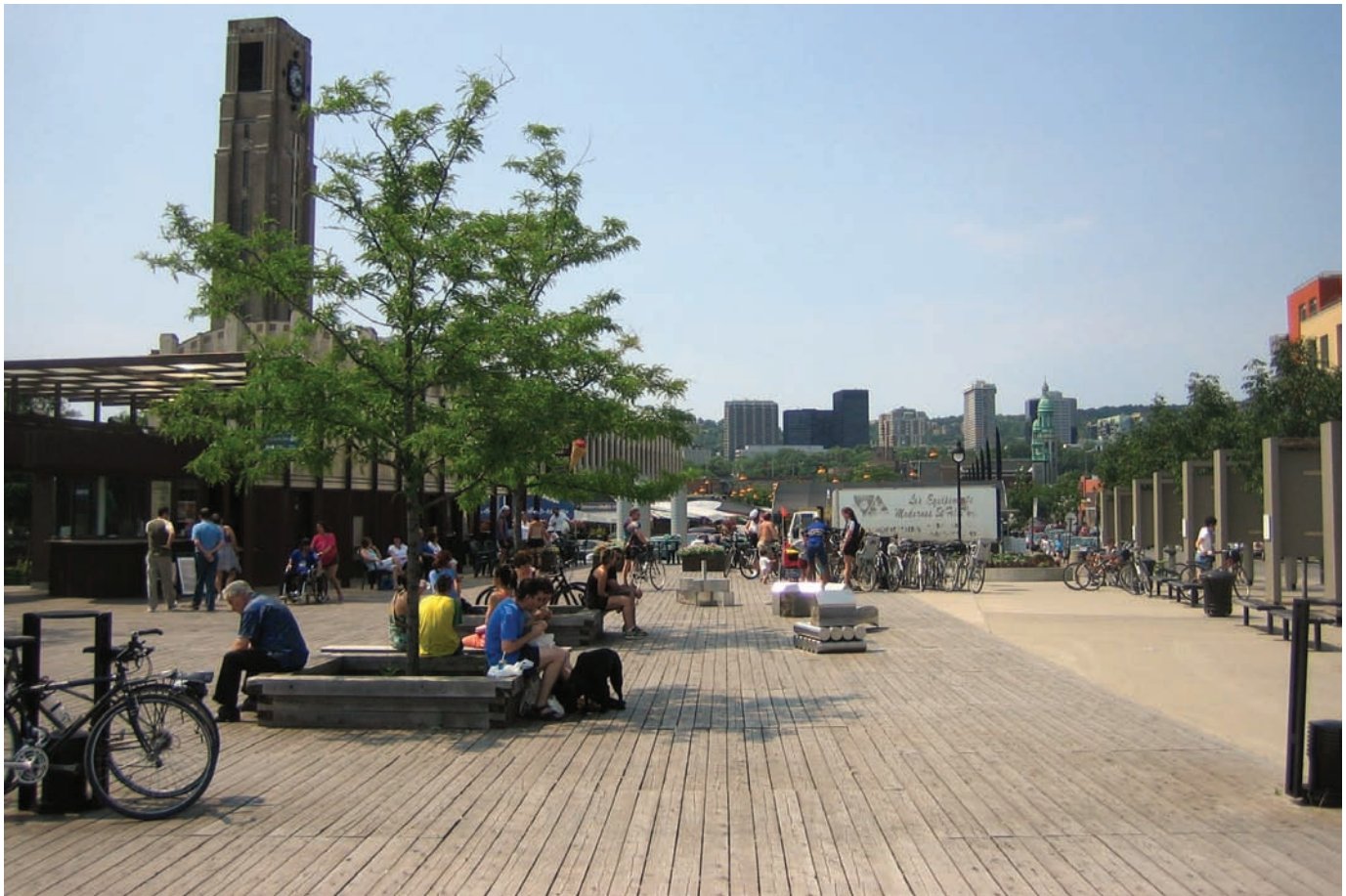
The Lachine Canal Trail in Montreal, Canada creates a vital connection between the Atwater Market and community trail users