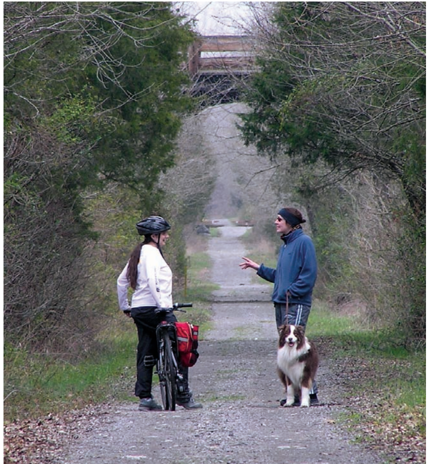
At their most basic, trails encourage personal interaction in a way entirely unavailable to automobile users. Were these individuals passing one another in cars, their interaction would be limited to, at most, a honk and a wave. Wilderness Trail, Va.

Community and family are at the heart of the American trail experience. One of the most significant benefits of trails is the sense of community and the connections they build. Well-designed trails transform “community” from an abstraction into a real place. While it is difficult to quantify the ties of community and family that trails help to build, the positive experiences of trail users can be captured in the stories embedded in the following pictures.