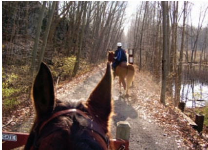
"Some trails are happy ones. Others are blue. It's the way you ride the trail that counts. Here's a happy one for you." — Dale Evans-Rogers, "Happy Trails." Paulinskill Valley Trail