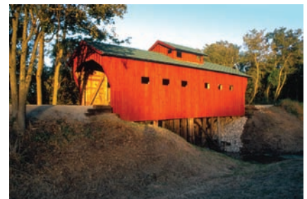
The Caboose Covered Bridge preserves the history and beauty of Wisconsin farmland. Glacier River Trail, Wis.