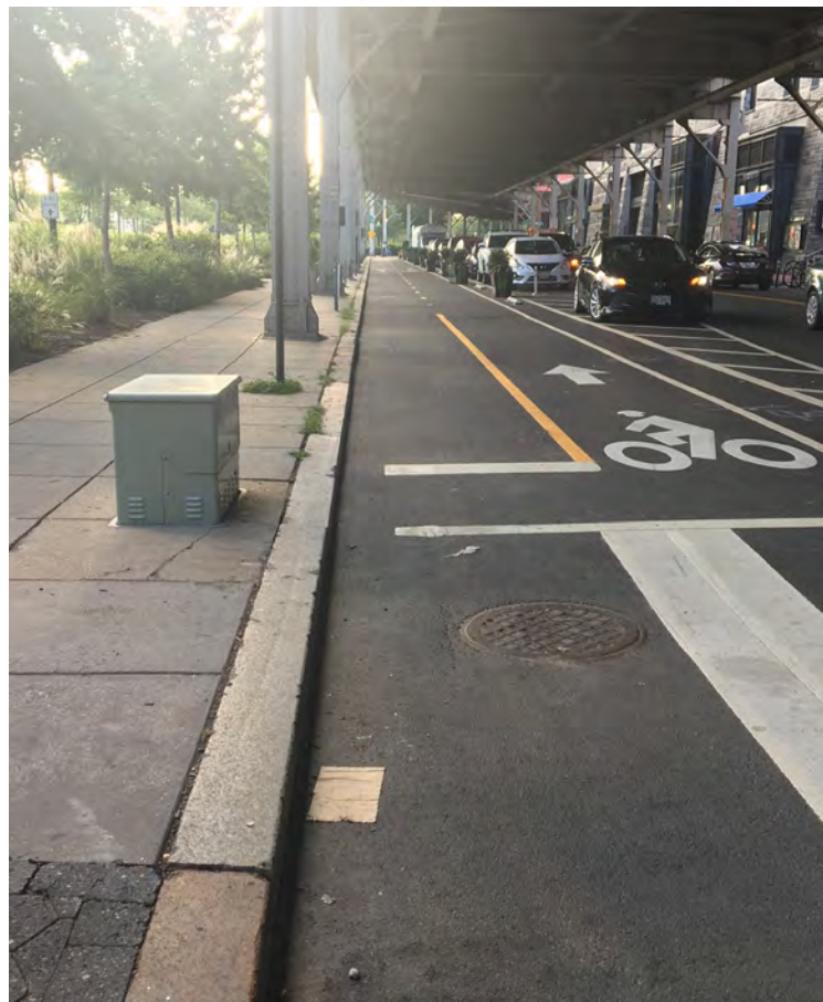
K Street/Water Street Cycle Track in the Georgetown neighborhood of Washington, D.C.

The Rock Creek Park Trails create a connection to a protected bike lane, or cycle track, along K Street/Water Street in the Georgetown neighborhood of Washington, D.C. (accessible via a ramp from K Street Northwest to Rock Creek Parkway). DDOT installed the two-way protected bike lane in 2018 along the length of K Street/Water Street, underneath the elevated Whitehurst Freeway, between 30th and 34th streets Northwest.