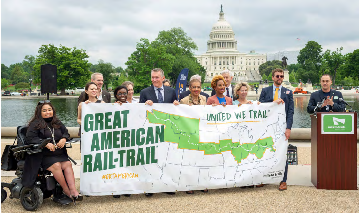
Del. Eleanor Holmes Norton and RTC staff and supporters at the Great American Rail-Trail launch in Washington, D.C., on May 8, 2019