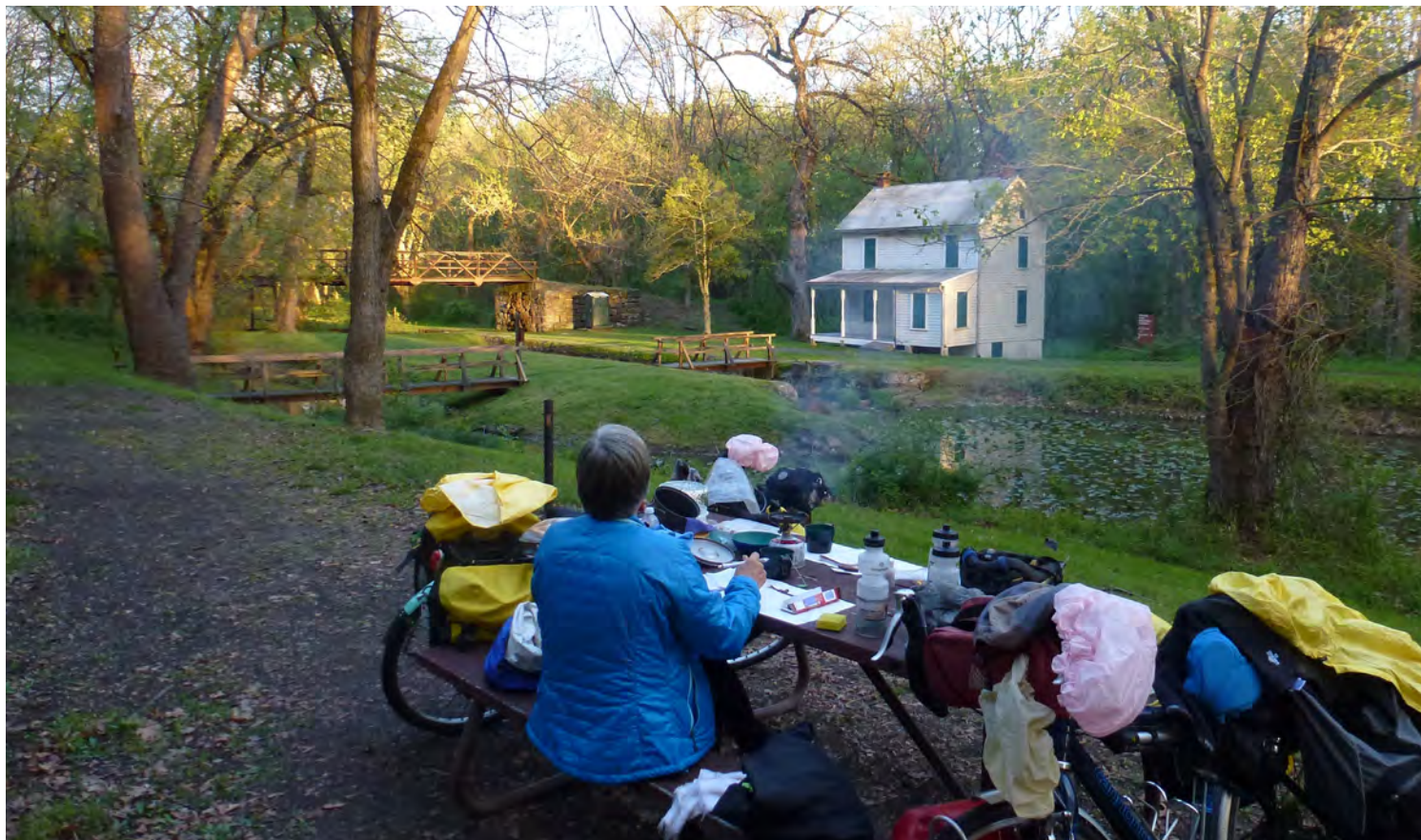
Lock 8 along the C&O Canal Towpath in Maryland