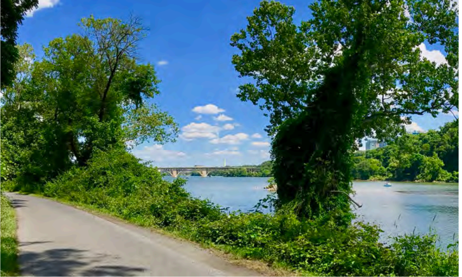
Capital Crescent Trail in Washington, D.C.