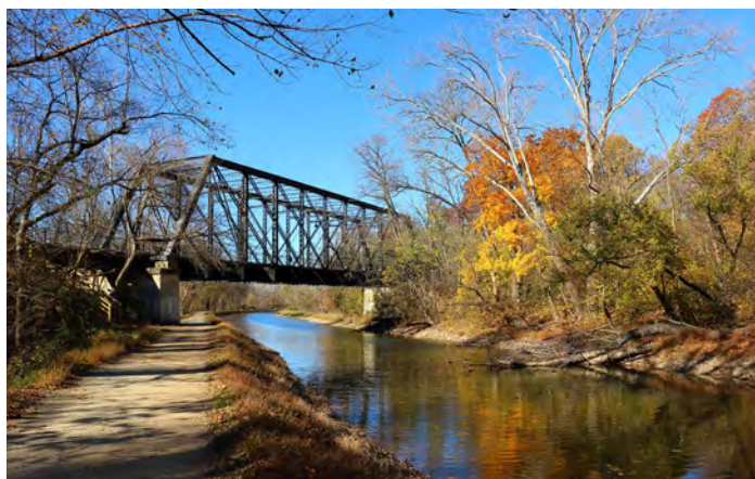
C&O Canal National Historical Park Traveling Under the Capital Crescent Trail

A journey westward along the Great American Rail-Trail will begin at the steps of the U.S. Capitol in Washington, D.C. The trail will travel among some of the most iconic landmarks in the nation's capital along the National Mall, including the Washington Monument and the Lincoln Memorial, where the trail heads north along the Rock Creek Park Trails. The route then picks up the Capital Crescent Trail in Georgetown, which flows into the towpath of the Chesapeake and Ohio (C&O) Canal National Historical Park stretching from Washington, D.C., to Cumberland, Maryland.