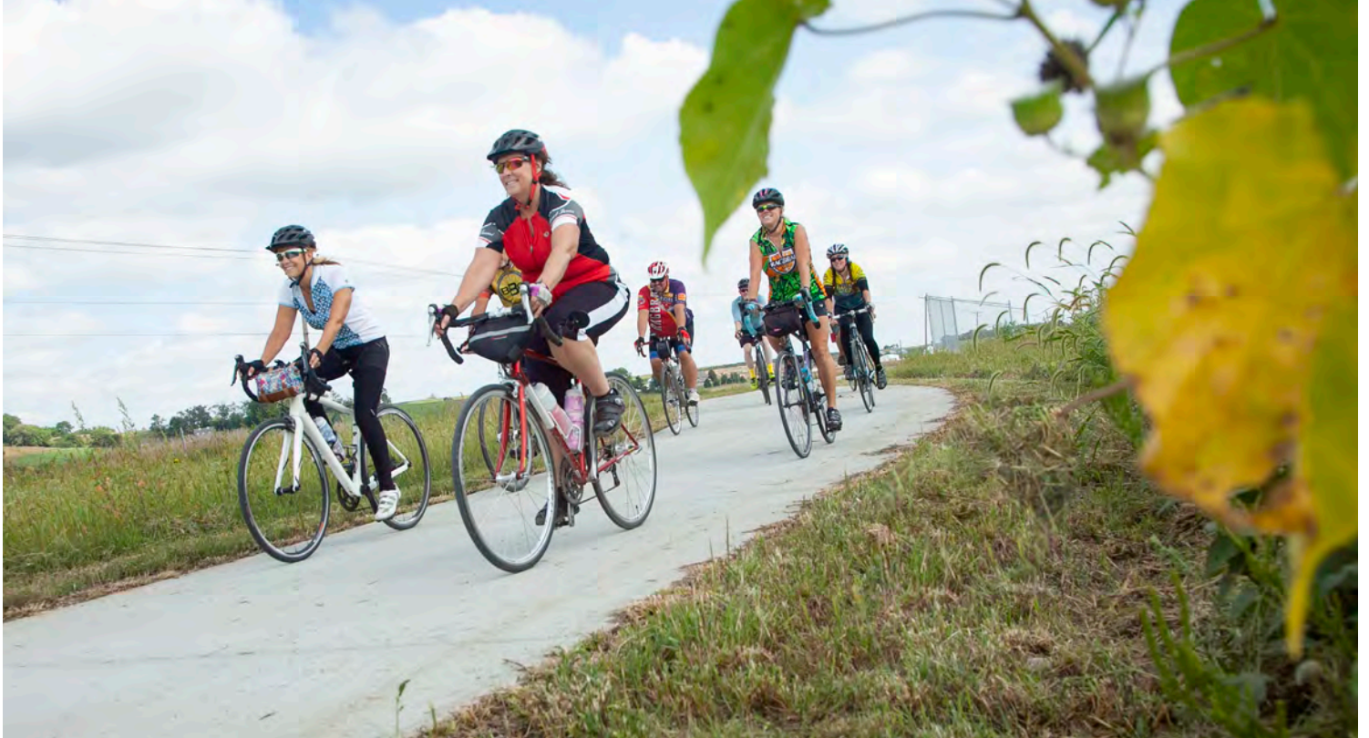
Riders along Iowa's Railroad Highway Trail