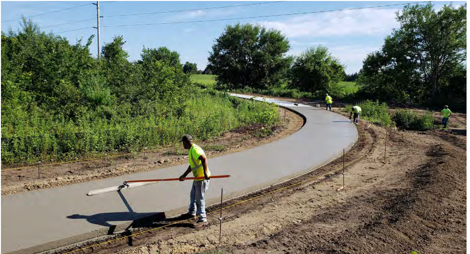
The Solon to Ely section of the Hoover Nature Trail under construction