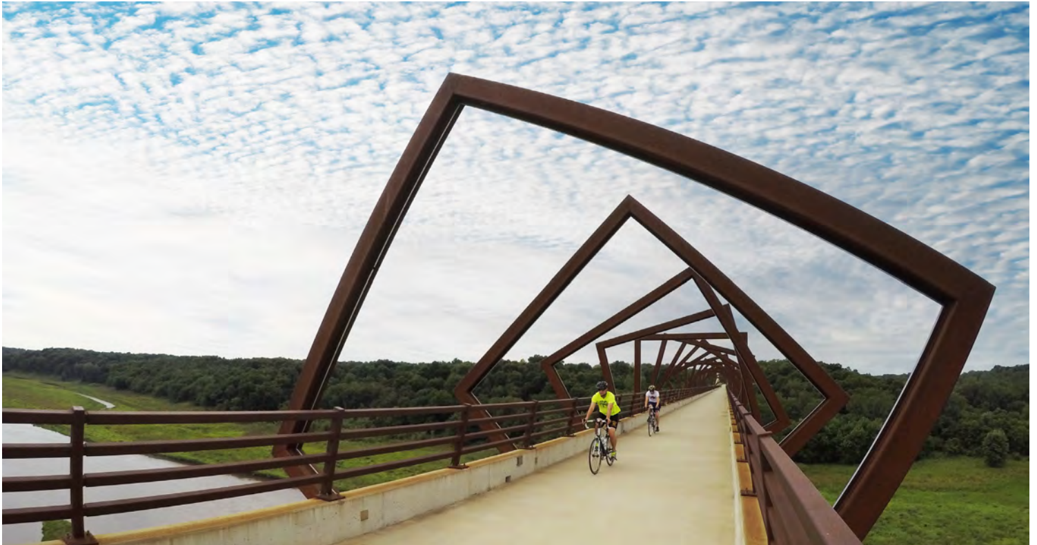
High Trestle Trail in Iowa | Photo by Milo Bateman, courtesy Rails-to-Trails Conservancy