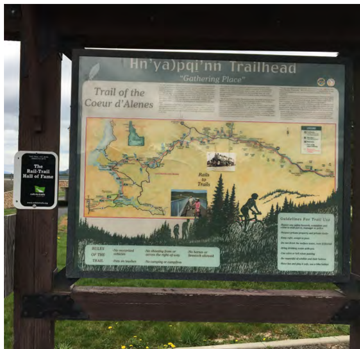
Trailhead for the Trail of the Coeur d’Alenes in Idaho

The Trail of the Coeur d’Alenes, inducted into the Rail-Trail Hall of Fame in 2010 (with the Route of the Hiawatha, also in Idaho), covers 71.3 miles of paved rail-trail through Idaho’s scenic mountains and valleys. The area has a rich mining, railroading and Native American history, and the Coeur d’Alene tribe was instrumental in the development of the trail. The trail originates in Mullan at 2nd and River streets and terminates in the west at the city of Plummer in a public park with interpretive signage on tribal history.