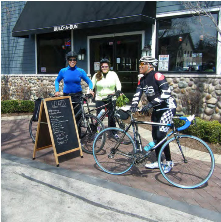
Riders stop for a refreshment along the Old Plank Road Trail in Frankfurt, Illinois