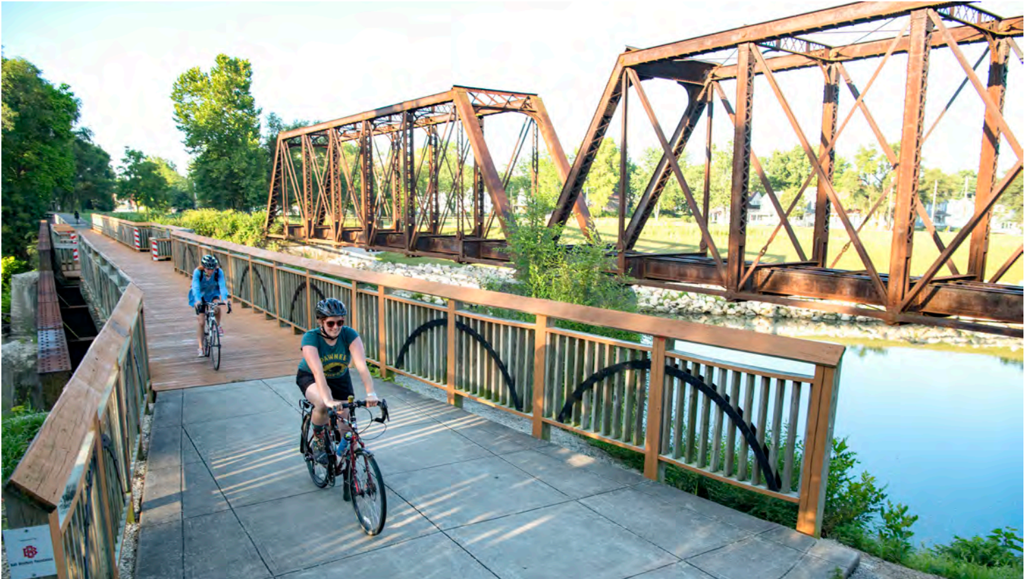
Indiana's Cardinal Greenway