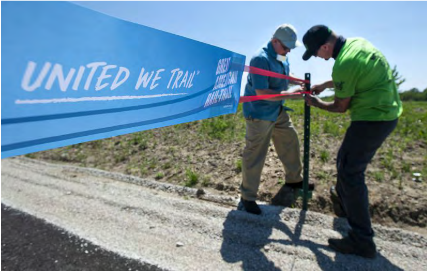
Prepping for a ribbon-cutting ceremony along a newly completed section of the Veterans Memorial Trail in June 2020 | Photo courtesy Chicago Tribune