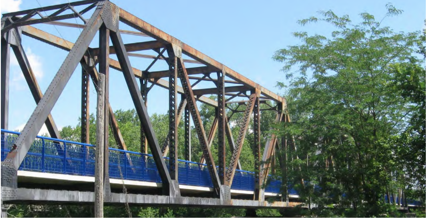
Wabash Bridge on Indiana's Nickel Plate Trail