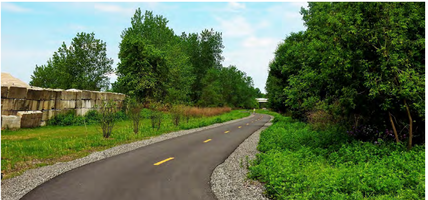
Indiana's Penny Greenway, headed northwest toward U.S. 41