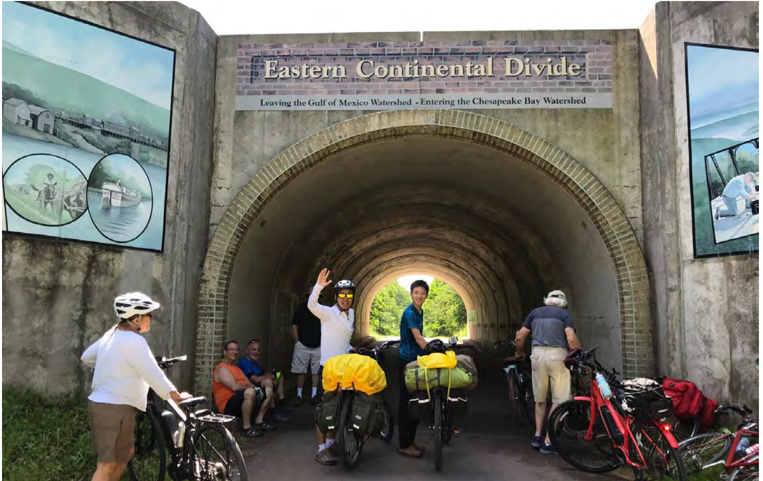
The Great Allegheny Passage at the Eastern Continental Divide in Maryland