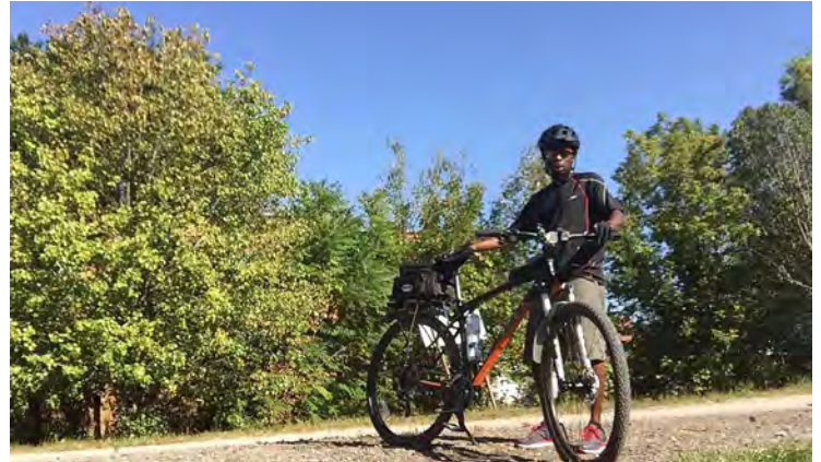
Panhandle Trail in West Virginia

The Great American Rail-Trail travels through the Northern Panhandle of West Virginia through the town of Weirton along the Ohio River. West Virginia contains the least number of miles along the Great American Rail-Trail of any state across the route. The West Virginia section is located along the Cleveland to Pittsburgh corridor of the proposed 1,500-mile Industrial Heartland Trails Coalition (IHTC).