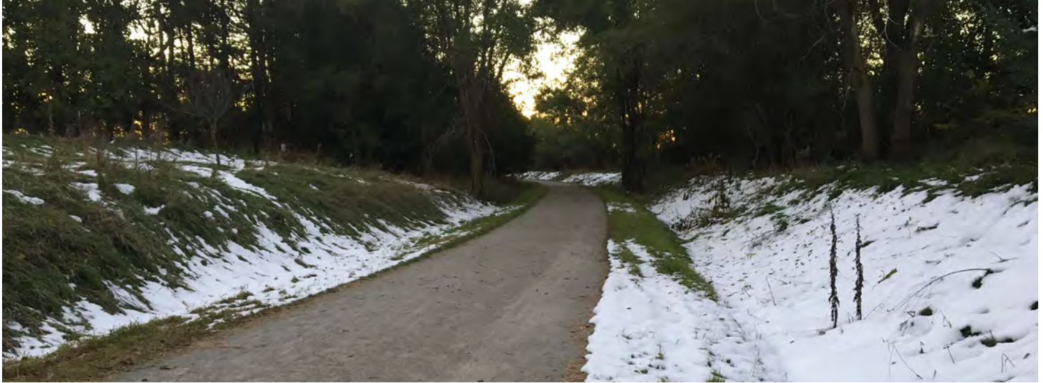
MoPac Trail East in Nebraska

The Turner Boulevard Trail connects with the Burt Street Trail at North 30th Street in Omaha. The Turner Boulevard Trail currently travels 1.9 miles. The Turner Boulevard Trail will host the Great American Rail-Trail for 1.8 miles, spanning the intersection of North 30th and Burt streets to the intersection of South 36th and Pacific streets to connect through Omaha. The trail is a shared-use path that runs along the west side of North 30th Street and Turner Boulevard, winding past several parks and neighborhoods and ending at the Field Club of Omaha.