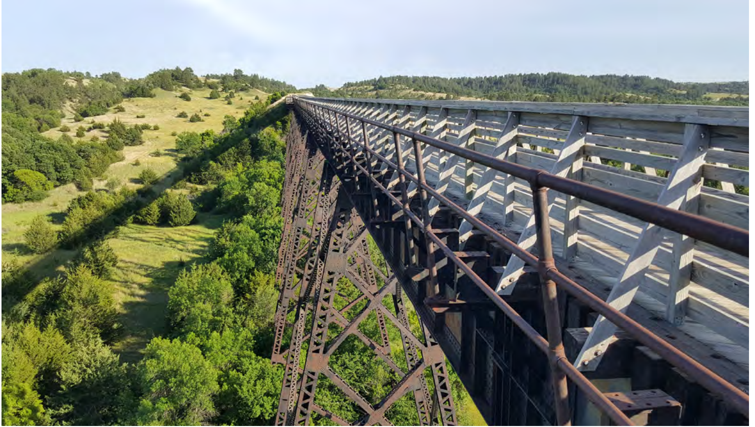
Cowboy Trail in Nebraska