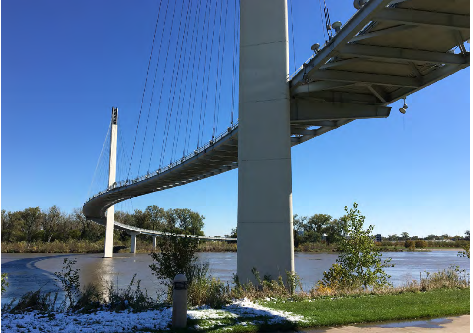
Bob Kerrey Pedestrian Bridge connecting Iowa and Nebraska