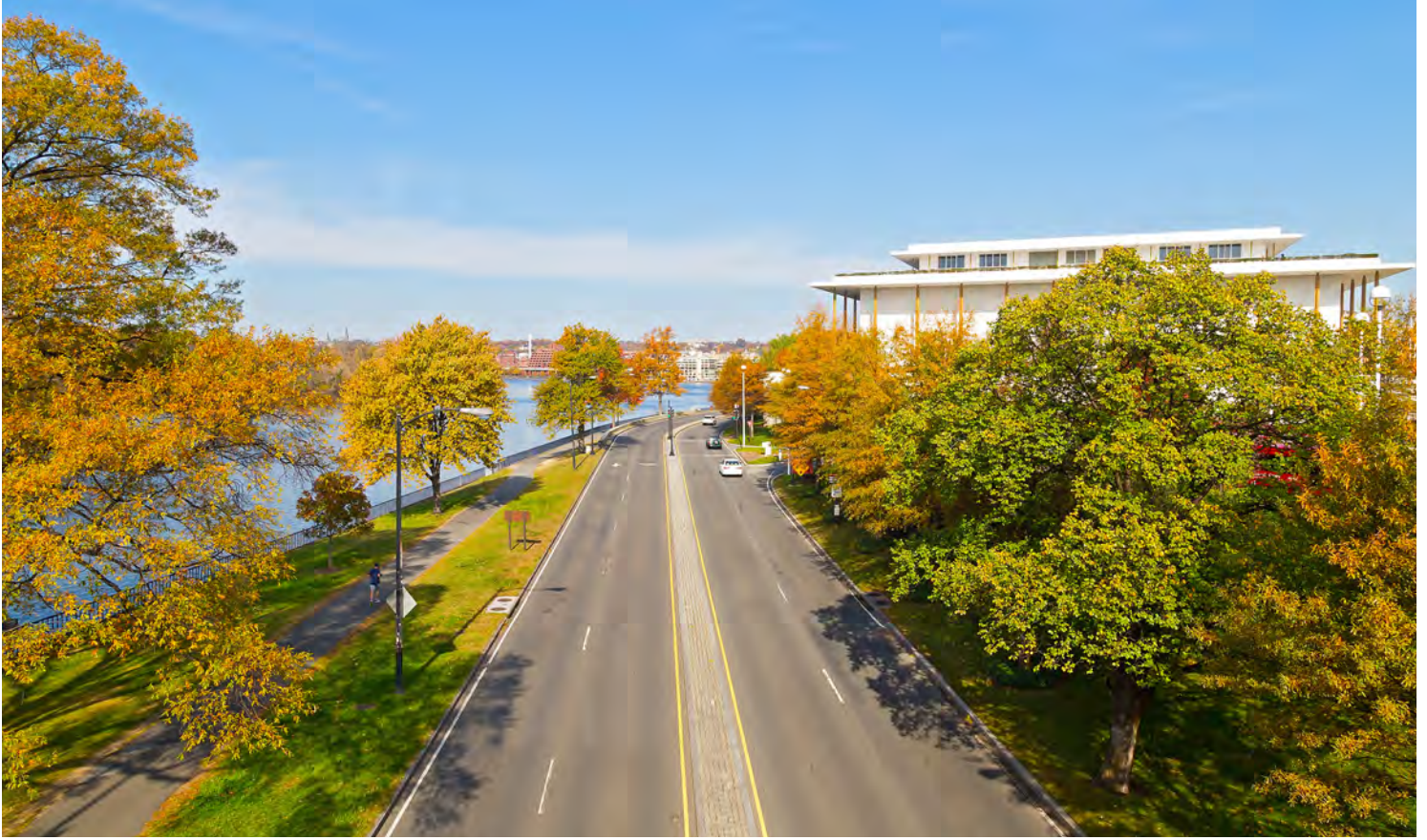
Rock Creek Park Trails near the John F. Kennedy Center for the Performing Arts in Washington, D.C.