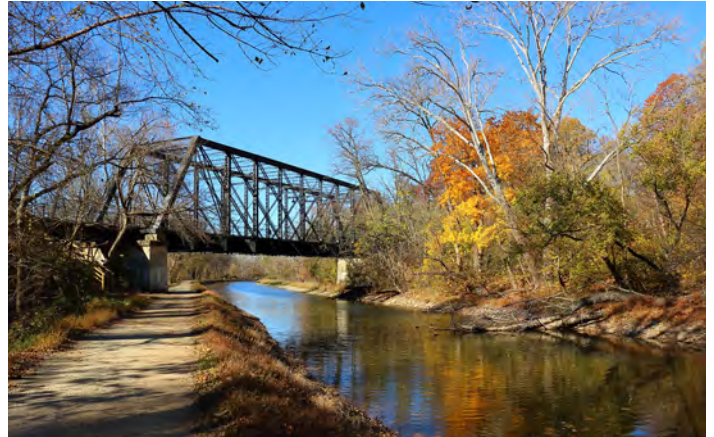
Capital Crescent Trail in Washington, D.C.

RTC found and reviewed six plans in Washington, D.C., to better understand the district’s trail priorities. A full list of these plans can be found in Appendix A.