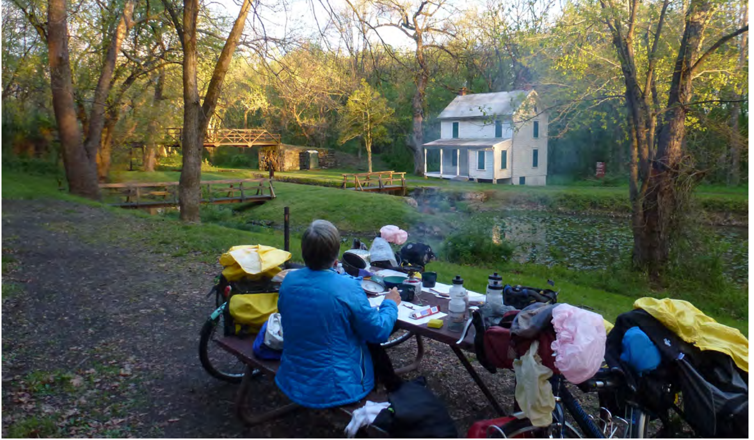
Lock 8 along the C&O Canal Towpath in Maryland