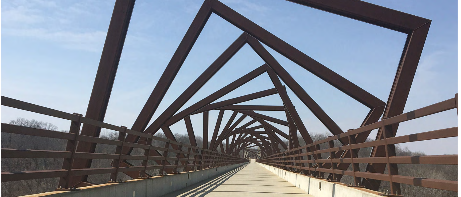
High Trestle Trail in Iowa | Photo by Kevin Belanger, courtesy Rails-to-Trails Conservancy