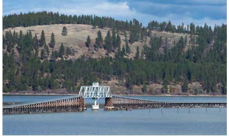
Trail of the Coeur d'Alenes in Idaho

RTC found and reviewed 15 plans in Idaho to better understand the state's trail priorities. A full list of these plans can be found in Appendix A.