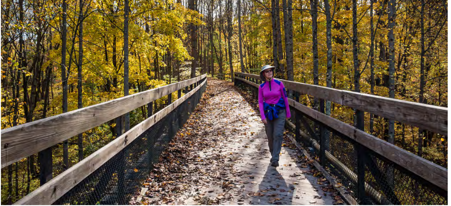
Great Allegheny Passage (gaptrail.org) in Pennsylvania