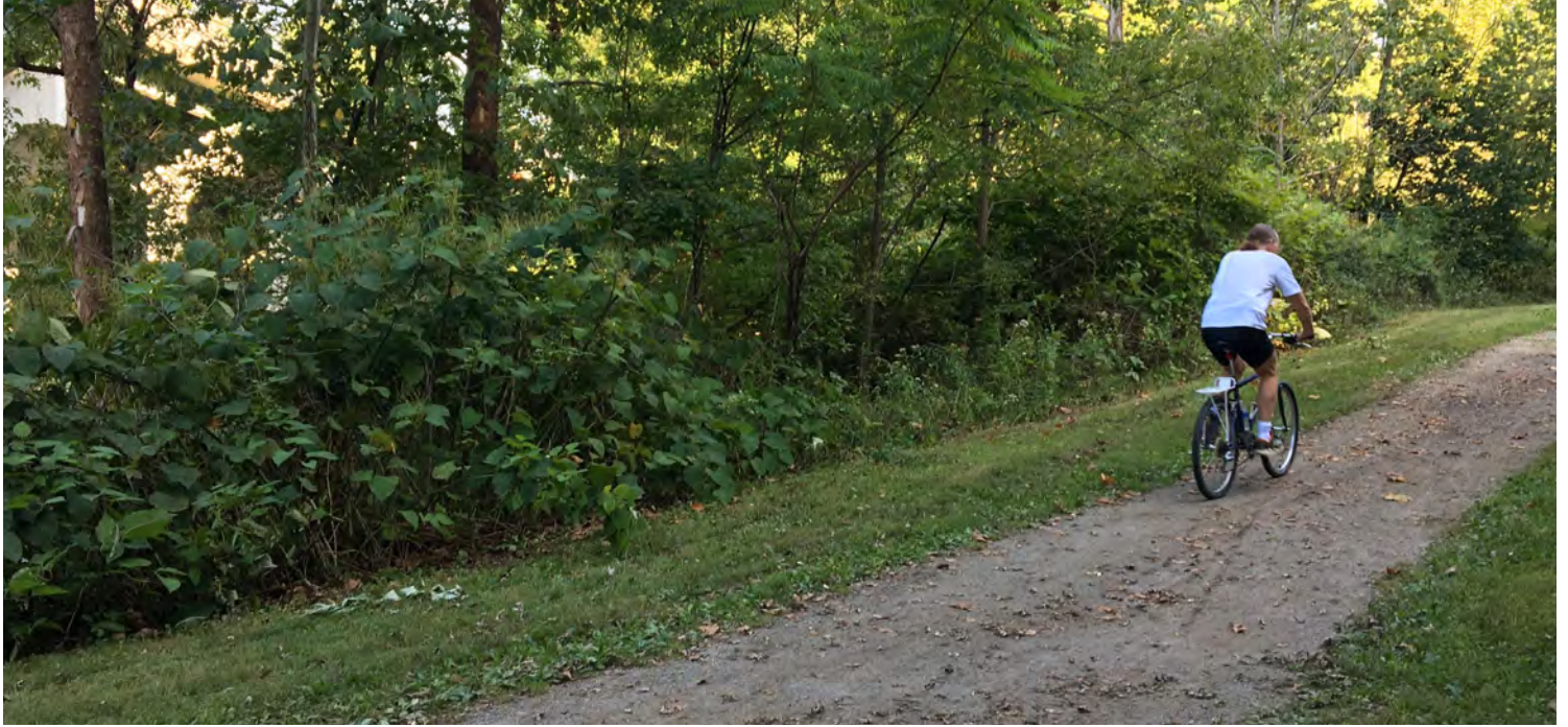
Montour Trail