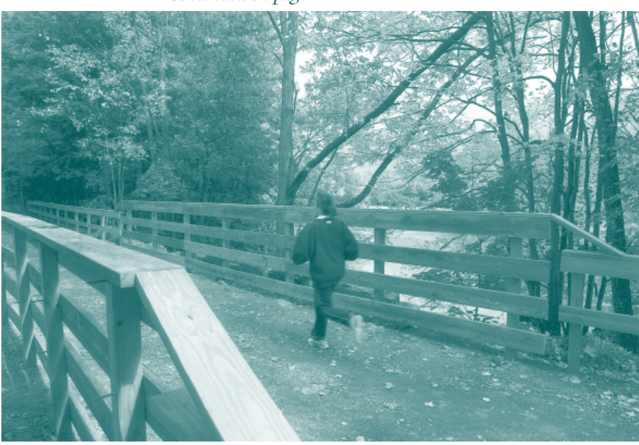
A runner enjoys the Manhan Rail-Trail, in East Hampton, Mass. The city is working to remediate asbestos contamination along a section of the rail corridor.