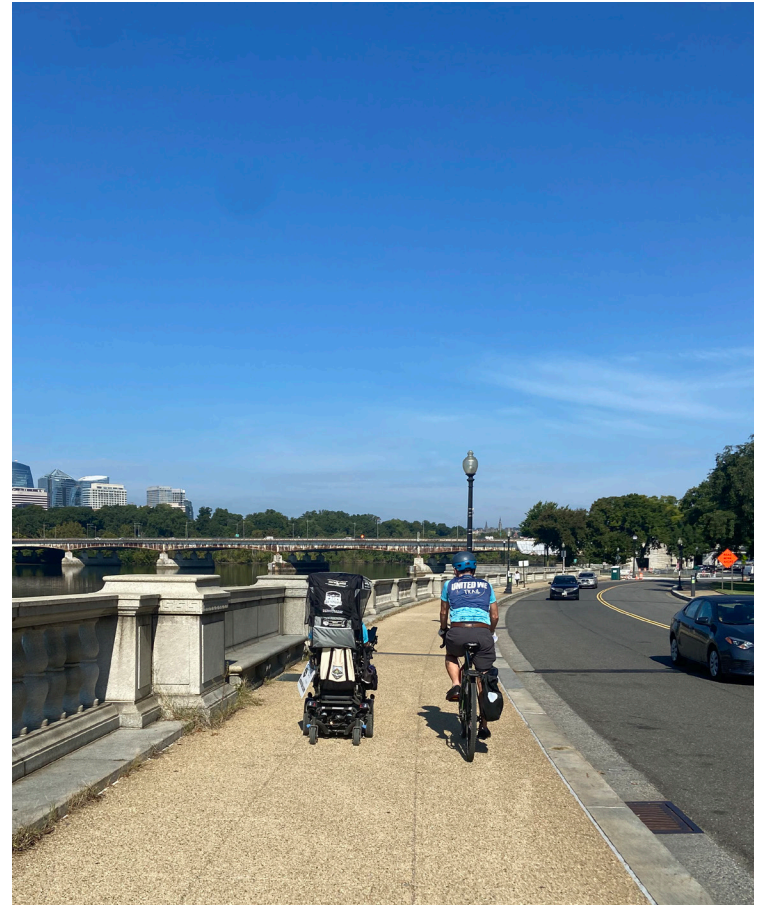
Ian Mackay on the first leg of his tour on the Great American Rail-Trail in the summer of 2022

The Rock Creek Park Trails create a connection to a protected bike lane, or cycle track, along K Street/Water Street in the Georgetown neighborhood of Washington, D.C. (accessible via a ramp from K Street Northwest to Rock Creek Parkway). DDOT installed the two-way protected bike lane in 2018 along the length of K Street/Water Street, underneath the elevated Whitehurst Freeway, between 30th and 34th streets Northwest. The two-way protected bike lane was extended all the way to the entrance of the Capital Crescent Trail in 2022.