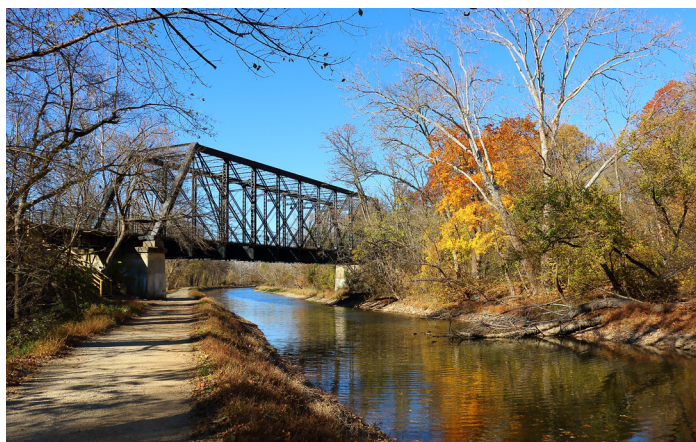
C&O Canal National Historical Park traveling under the Capital Crescent Trail

A journey westward along the Great American Rail-Trail will begin at the steps of the U.S. Capitol in Washington, D.C. The trail will travel among some of the most iconic landmarks in the nation's capital along the National Mall, including the Washington Monument and the Lincoln Memorial, where the trail heads north along the Rock Creek Park Trails. The route then picks up the Capital Crescent Trail in Georgetown, which flows into the towpath of the Chesapeake and Ohio (C&O) Canal National Historical Park stretching from Washington, D.C., to Cumberland, Maryland.