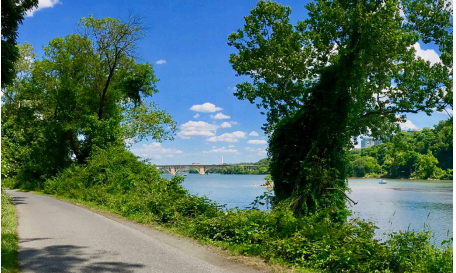
Capital Crescent Trail in Washington, D.C.