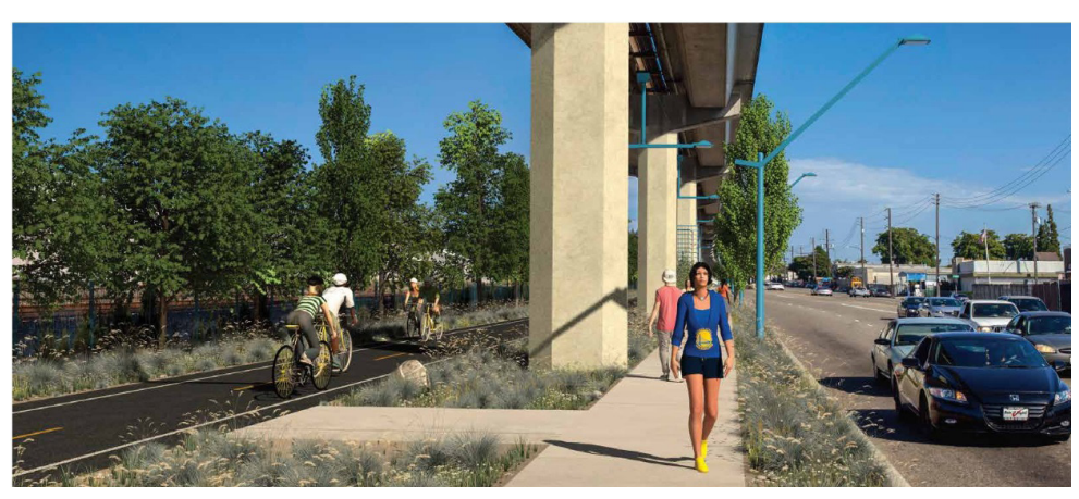
Rendering of East Bay Greenway with Class I Bikeway (rail-trail)