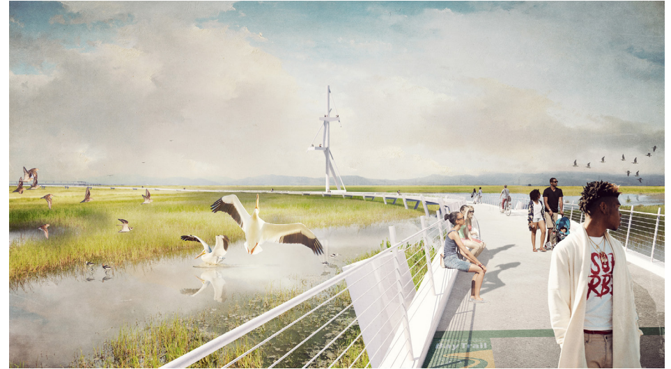
Rendering of proposed bike trails and bird tower along SR37