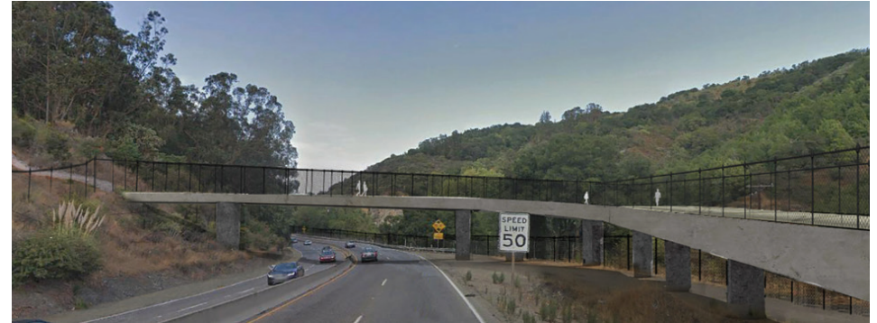
Rendering of Northern Overcrossing (TrailPeople)