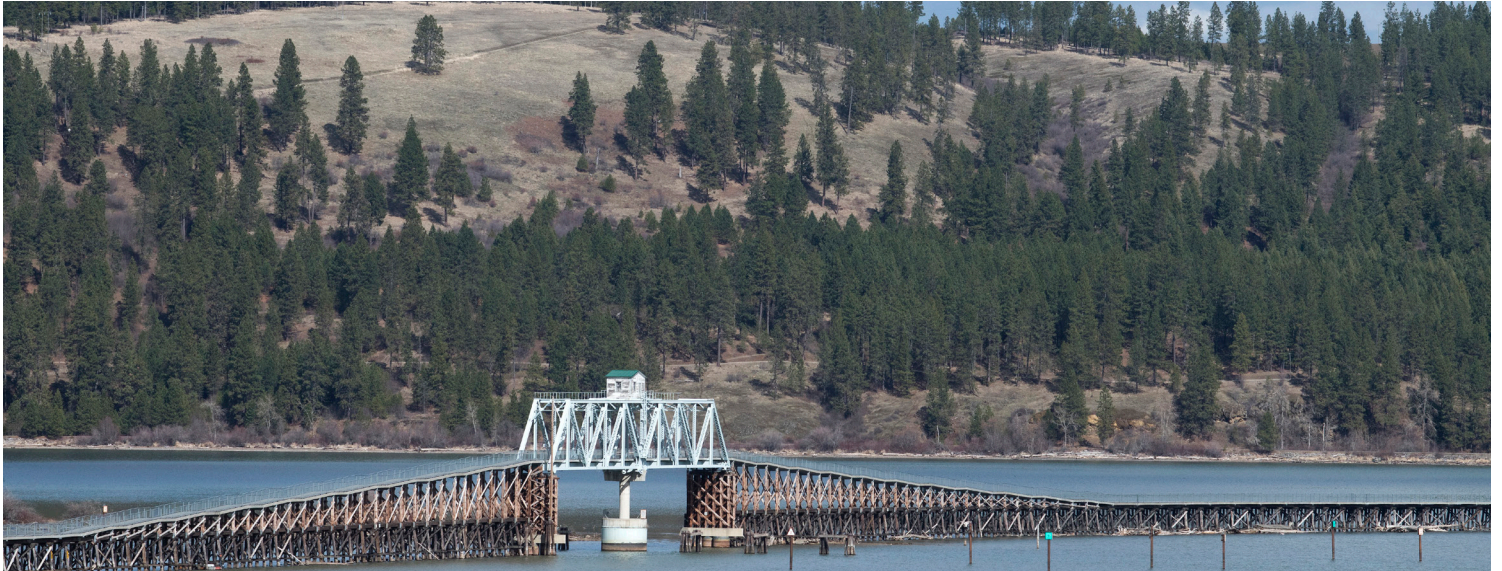
The Chatcolet Bridge carries the Trail of the Coeur d'Alenes across Lake Coeur d'Alene.