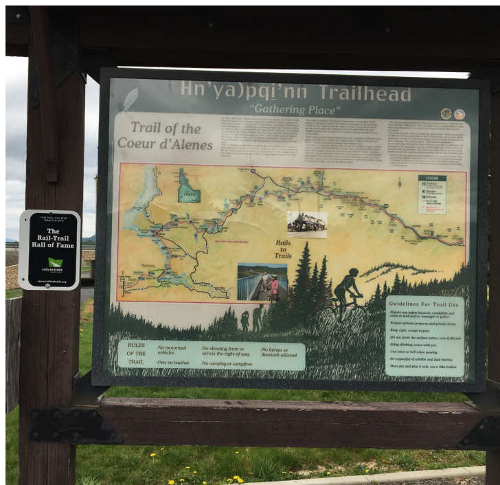
Trailhead for the Trail of the Coeur d’Alenes in Idaho

The Trail of the Coeur d’Alenes, inducted into RTC’s Rail-Trail Hall of Fame in 2010 (with the Route of the Hiawatha, also in Idaho), covers 71.3 miles of paved rail-trail through Idaho’s scenic mountains and valleys. The area has a rich mining, railroading and Native American history, and the Coeur d’Alene tribe was instrumental in the development of the trail. The trail originates in Mullan at 2nd and River streets and terminates in the west at the city of Plummer in a public park with interpretive signage on tribal history.