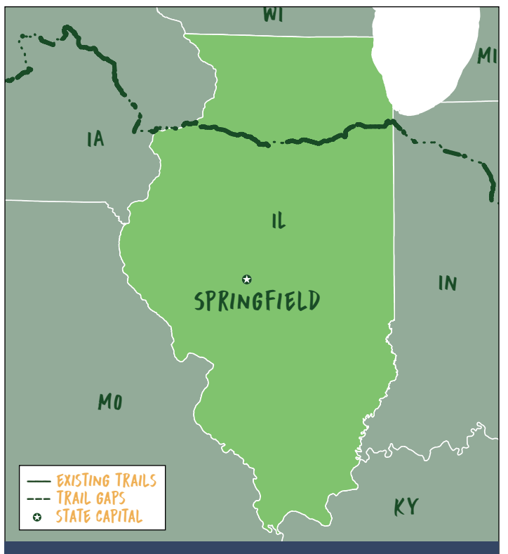
194 TOTAL MILES / 85% COMPLETE

Western Illinois is home to two iconic trails: the Hennepin Canal Parkway and the Illinois & Michigan Canal State Trail, crossing historic locks and bridges and passing picturesque farms. A gap of 15 miles between the trails remains to be completed.