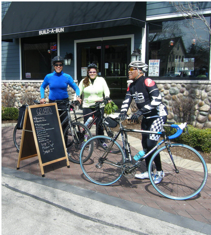
Riders stop for a refreshment along the Old Plank Road Trail in Frankfurt, Illinois