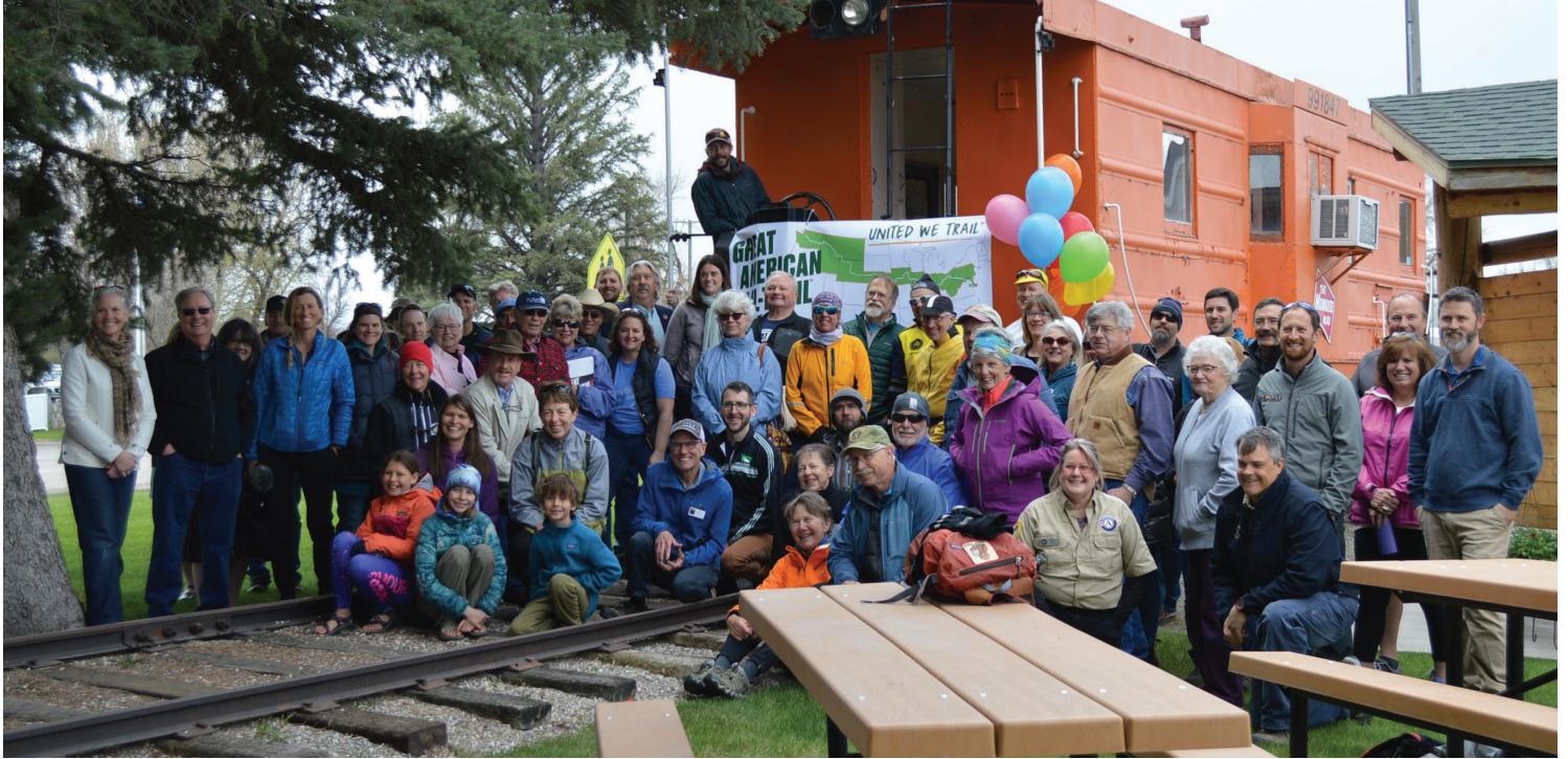
Celebrating the announcement of the Great American Rail-Trail route in Three Forks, Montana