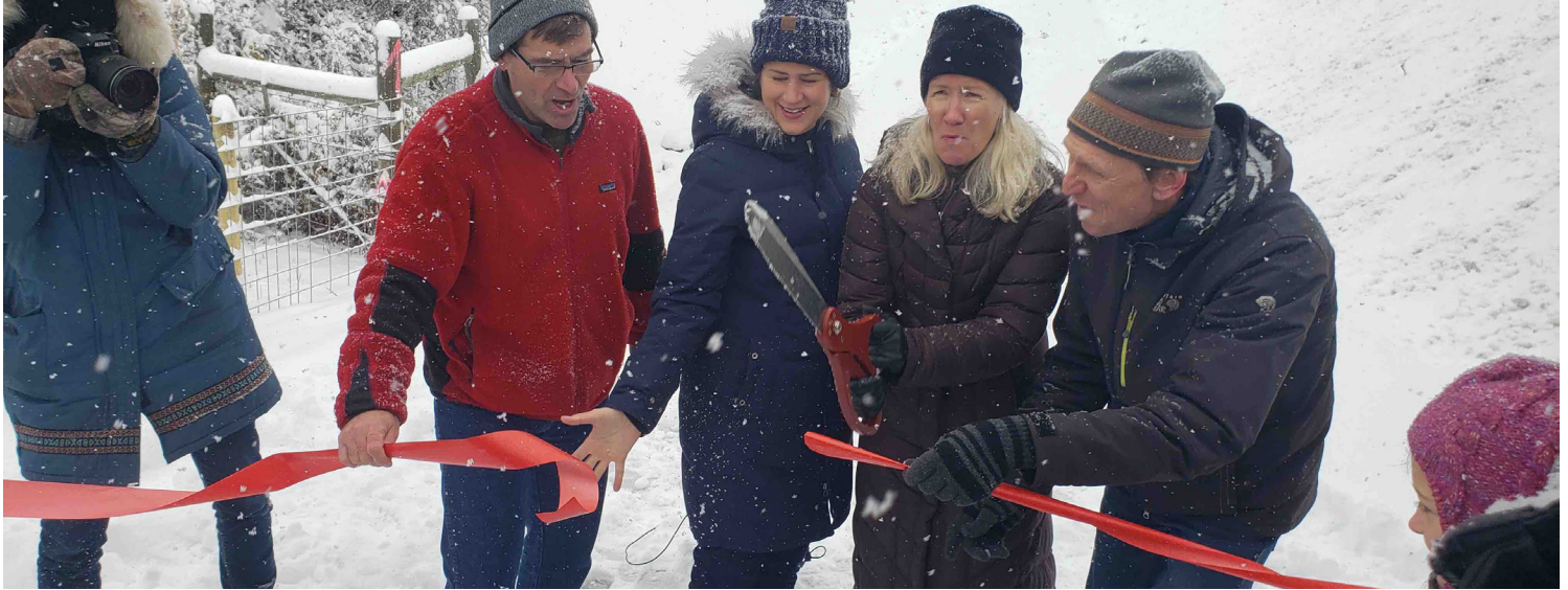
Ribbon cutting of the Bozeman to Bridger Mountains Trail in October 2019