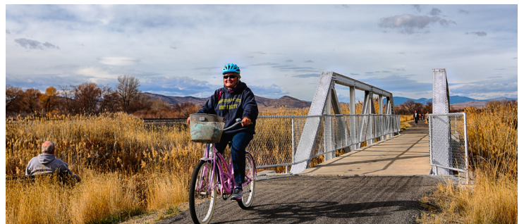
Headwaters Trail System in Montana

A group in Manhattan has identified a 15.5-mile corridor utilizing the former railroad corridor and other linear features to connect Manhattan to the Headwaters Trail System in Three Forks. The Manhattan Planning Board approved the concept, the town council endorsed it, and the Gallatin County Commission was briefed in early 2021. The project is making progress toward construction, which may be a few years away.