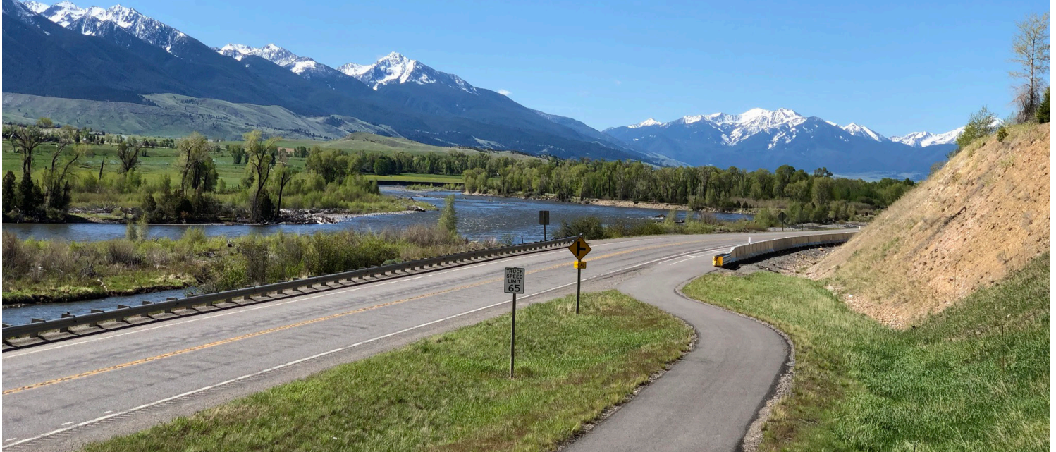
Paradise Valley in Montana