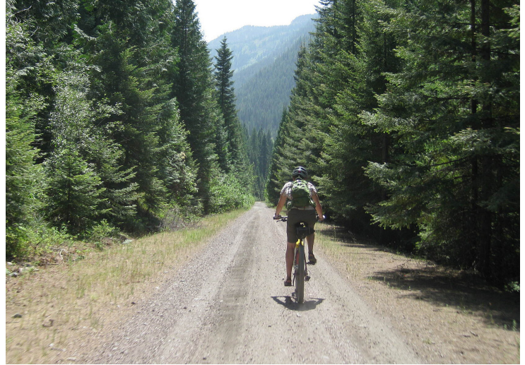
NorPac Trail, headed toward Mullan, Idaho

The Dominion tunnel and trestle are located near the midpoint of the trail, and the trailbed from the eastern terminus to the trestle is a sparsely traveled, two-lane road of fine gravel. West of the trestle, the trail turns into a single-lane gravel road with loose surface rock. 7