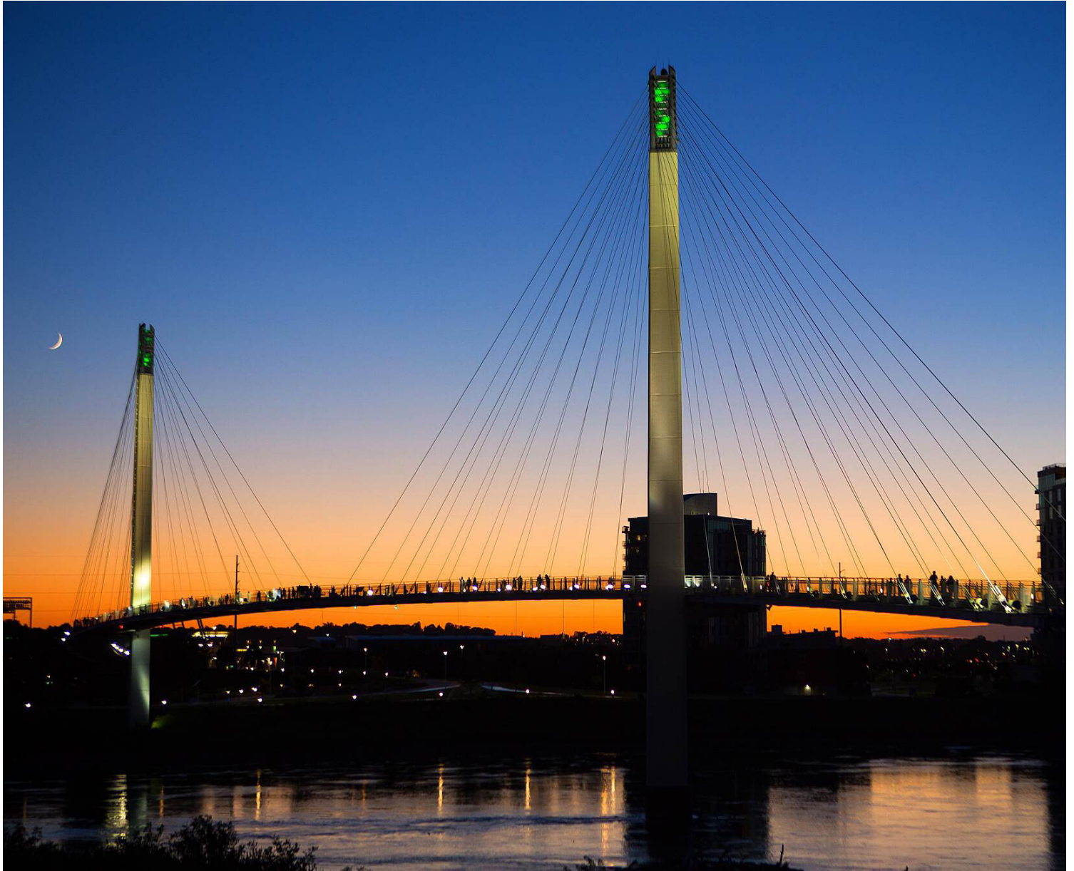
Bob Kerrey Pedestrian Bridge connecting Iowa and Nebraska