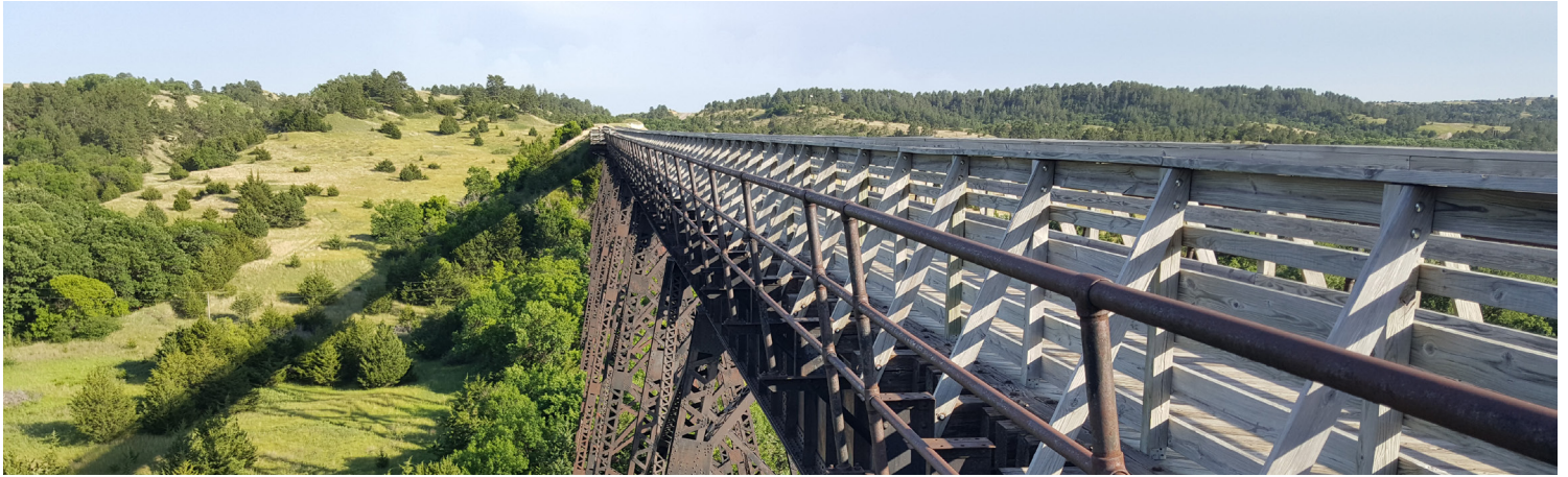
Cowboy Trail in Nebraska