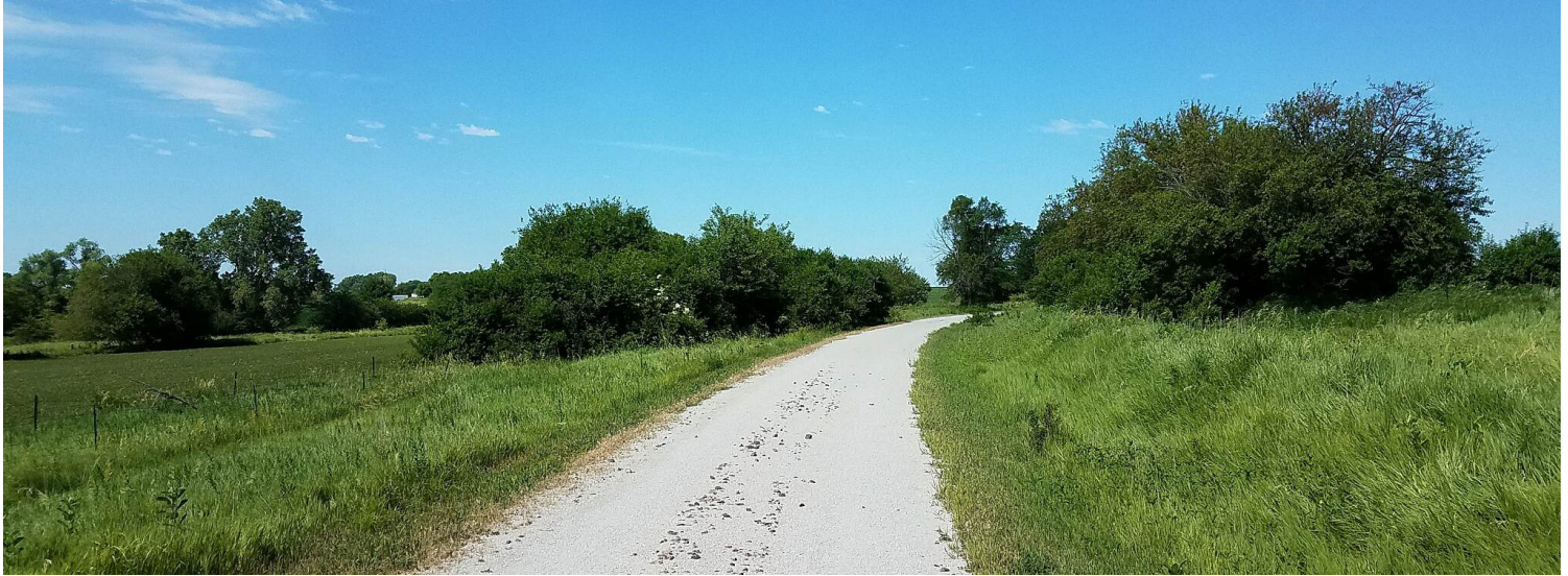
MoPac Trail East in Nebraska

The Turner Boulevard Trail connects to the Burt Street Trail at North 30th Street in Omaha. The Turner Boulevard Trail currently travels 2.2 miles. The Turner Boulevard Trail will host the Great American Rail-Trail for 2.1 miles, spanning the intersection of North 30th and Burt streets to Pacific Street at the Field Club of Omaha. The trail is a shared-use path that runs along the west side of North 30th Street and Turner Boulevard, winding past several parks and neighborhoods and ending at the Field Club of Omaha.