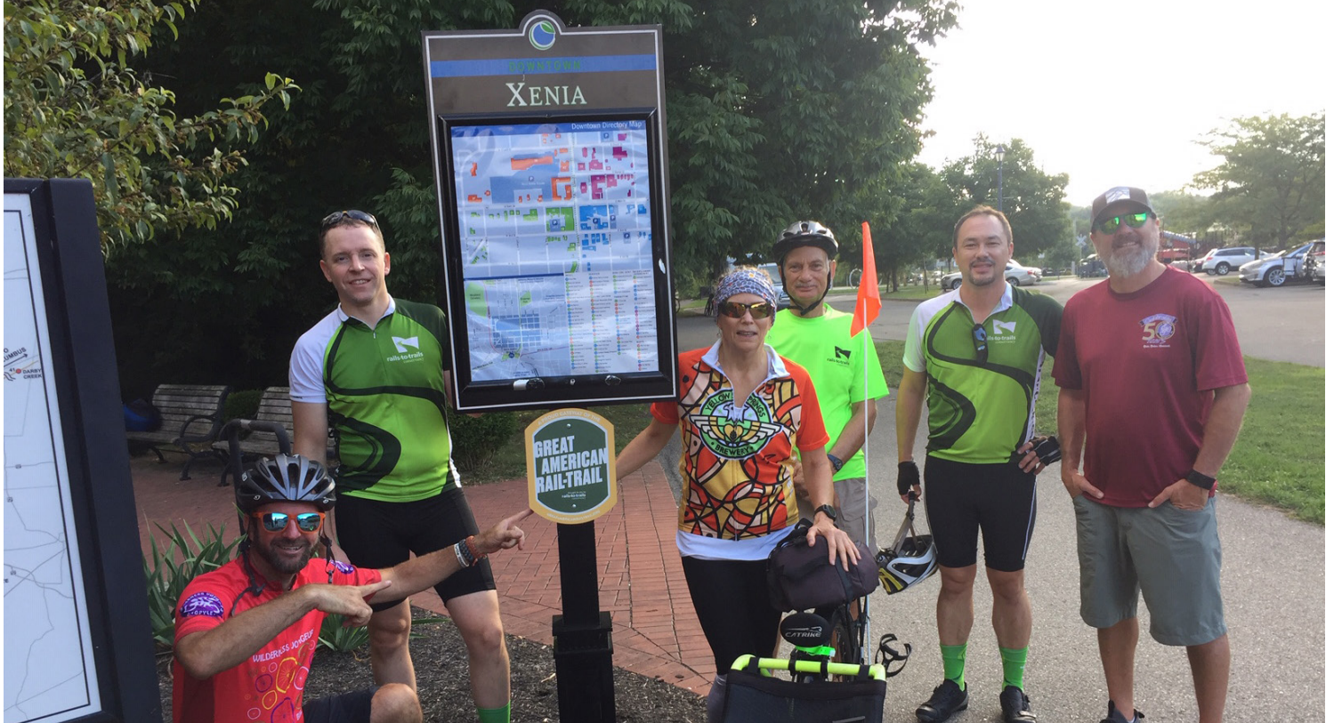
The Great American Rail-Trail passes through Xenia, Ohio, along the Ohio to Erie Trail.