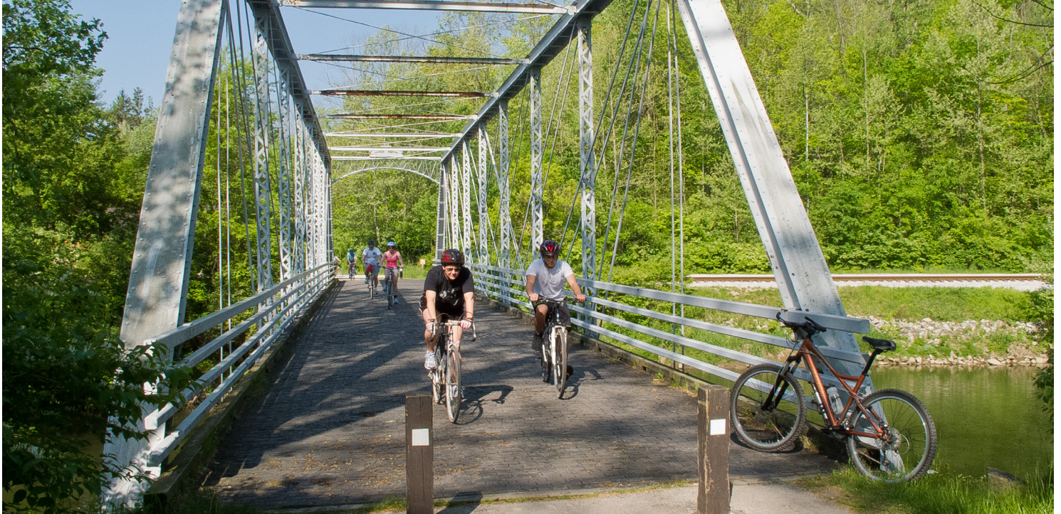
Ohio & Erie Canalway Towpath Trail in Ohio