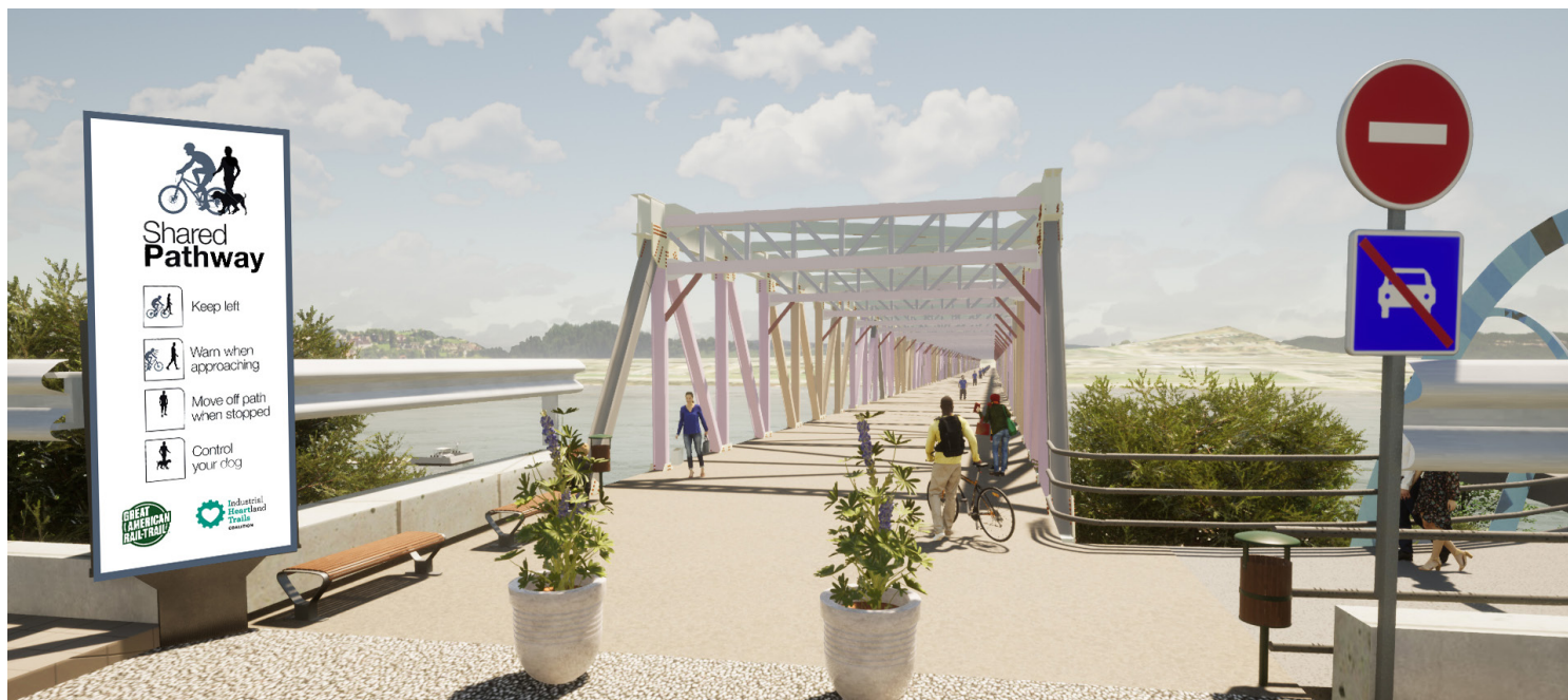
Rendering of the Market Street Bridge if converted to trail use | Created by Divya Manek