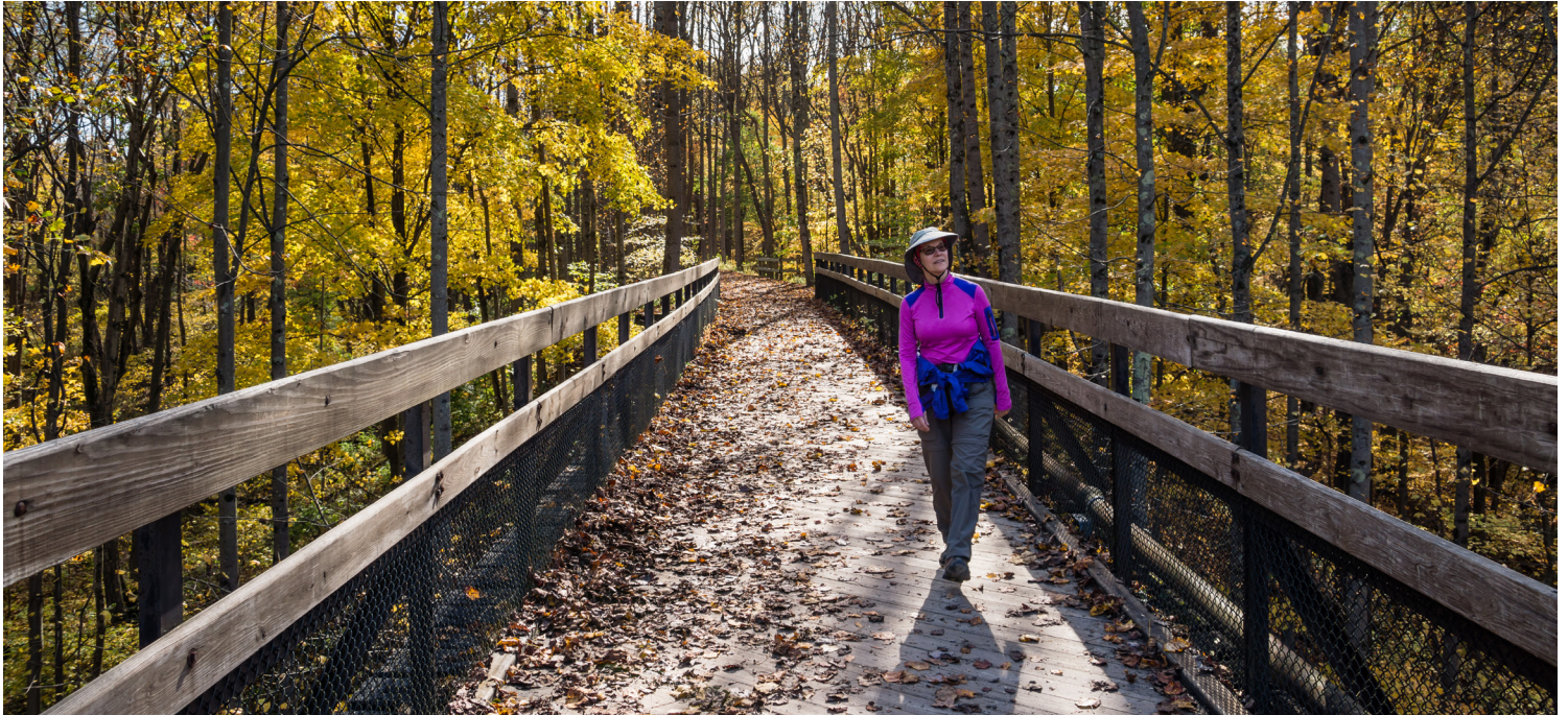
Great Allegheny Passage (gaptrail.org) in Pennsylvania