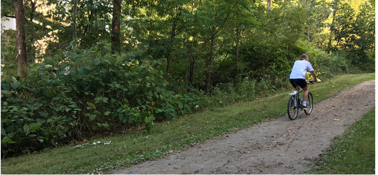
Montour Trail