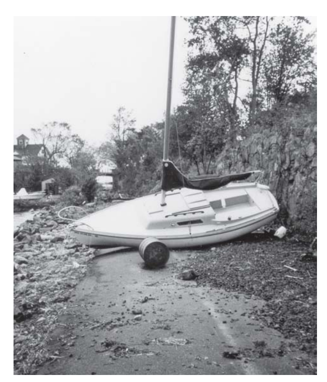
A good management plan will allow for detection and warning of non-permanent hazards. (David Burwell)

The recreational use statutes appear to be "working" in the sense that they are limiting liability to the extent that was intended. In addition to recreational use statutes, some states have special statutes limiting liability that may be applicable. Pennsylvania, for example, has a specific trails statute (Act 32 P.S. §§ 5621 et seq.) which limits liability for landowners who allow their land to be used for trails, trail owners, and adjacent property owners with protections similar to a recreational use statute.