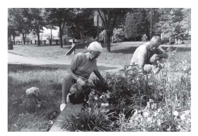
Using volunteers is a great way to keep your trail operating smoothly and create a feeling of community ownership. (Dave Dionne)