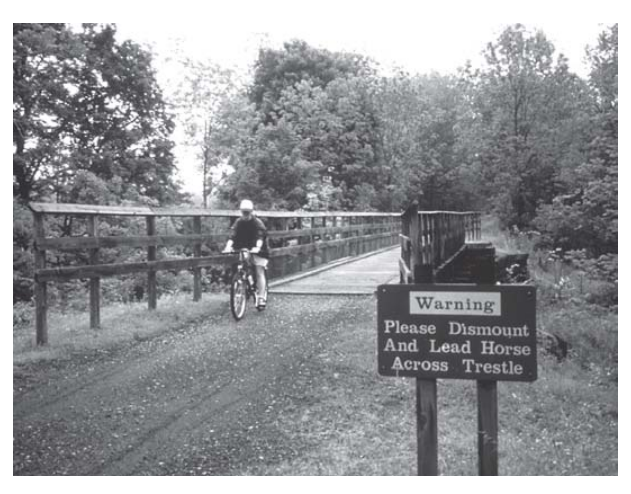
Trail managers cite warning signs as a good risk management technique.

The managing agency should also develop a comprehensive maintenance plan that provides for regular maintenance and inspection. These procedures should be spelled out in detail in a trail management handbook and a record should be kept of each inspection including what was discovered and any corrective action taken. The trail manager should attempt to warn of or eliminate any hazardous situations before an injury occurs. Private landowners that provide public easements for a trail should ensure that such management