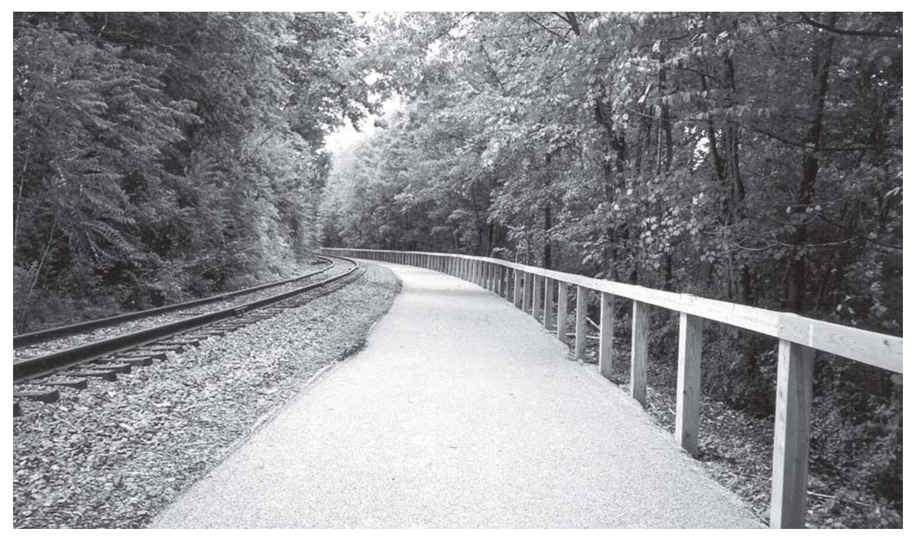
Sixty-one rails-with-trails now operate safely in the United States. For more information, see Rails-with-Trails, by Rails-to-Trails Conservancy.