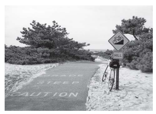
Warning signs help minimize the threat of liability. (John McDermott)

Questions related to legal liability for accidents or injuries on or adjacent to trails must be answered in terms of state common (judge-made) law,<sup>2</sup> which varies from state to state. The following discussion provides a broad overview of trail