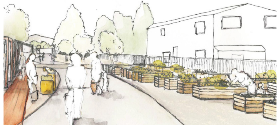
Rendering of proposed food hub between First Street and Second Street along future Richmond Greenway segment 5