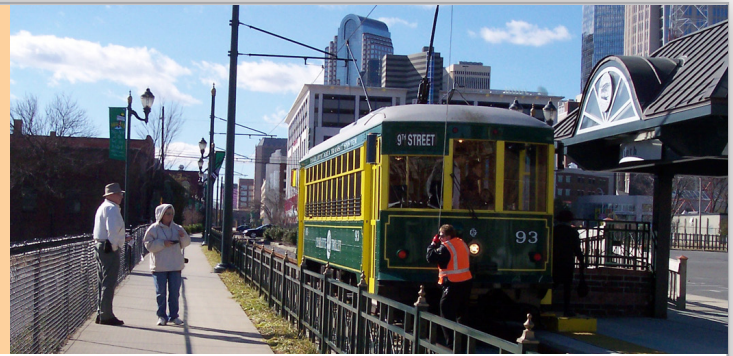
The Trolley Trail in downtown Charlotte, N.C., is sometimes referred to as the “station access trail” by local residents because of its excellent connection to the city's light rail system.

Houston's growing light rail network is expanding to the city's East End, serving predominately Hispanic neighborhoods along Harrisburg Boulevard. Working with Metro and the Houston-Galveston Area Council's Livable Centers program, the Greater East End Management District created a plan to improve pedestrian access from neighborhood streets to the new transit line. District funds supported improvements within the light rail corridor, and federal American Recovery and Reinvestment Act (ARRA) funds were awarded to construct sidewalks on nearby streets that connect to the light rail—a total of $7.75 million is being spent on sidewalk