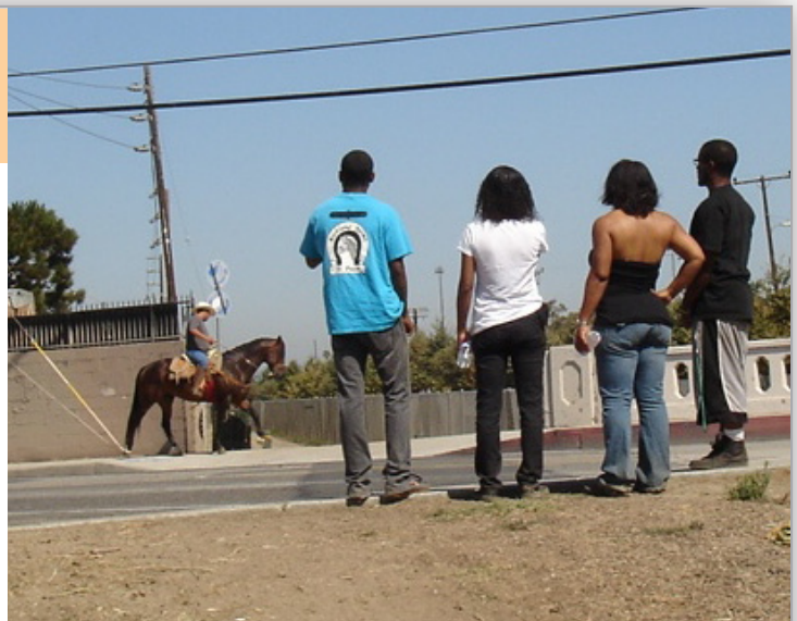
Pedestrians and equestrians must navigate wide, busy street crossings on the Compton Creek Bike Path and Multi-Use Trail.

Compton Creek Trail users must navigate across four to six lanes of fast-moving traffic several times, creating significant obstacles to using the trail. Most intersections do