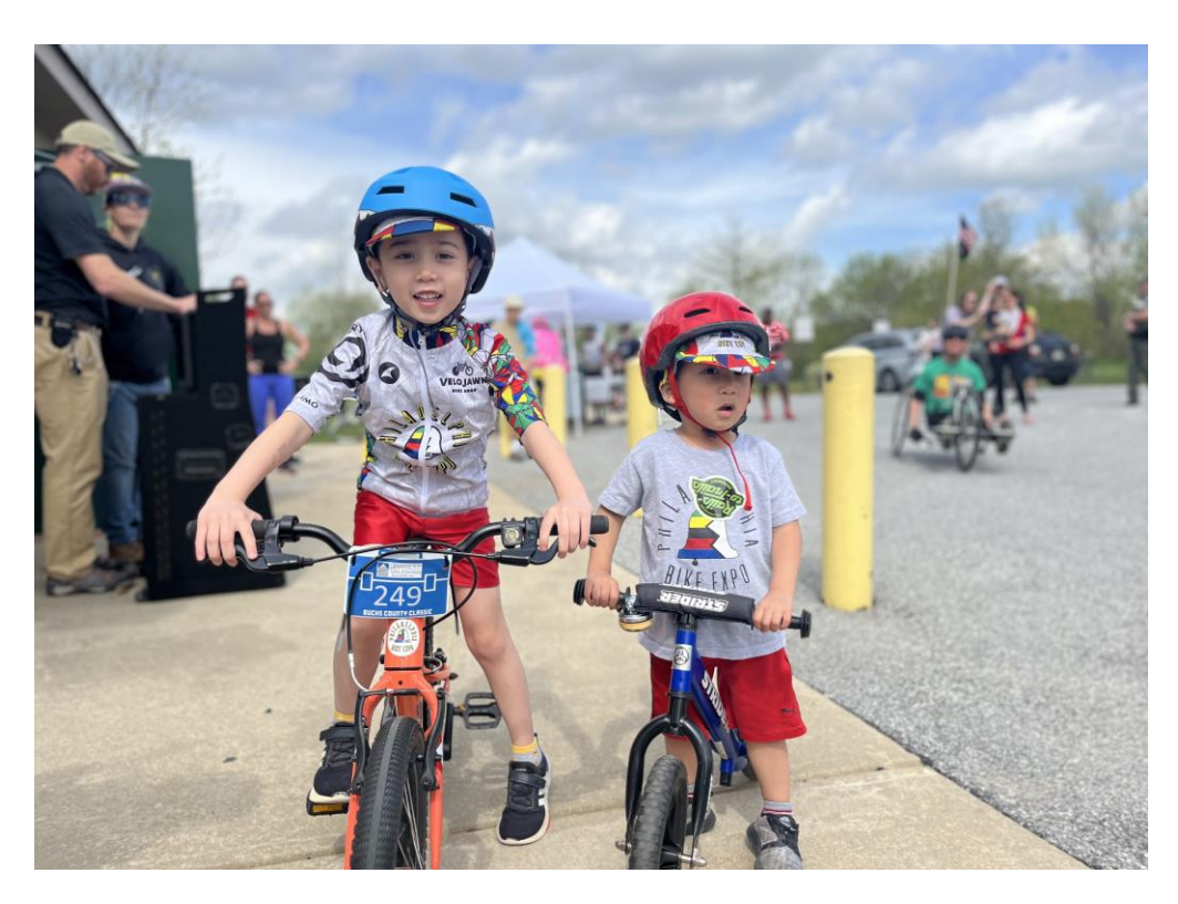
Photo of Celebrate Trails Day event in Exton, PA