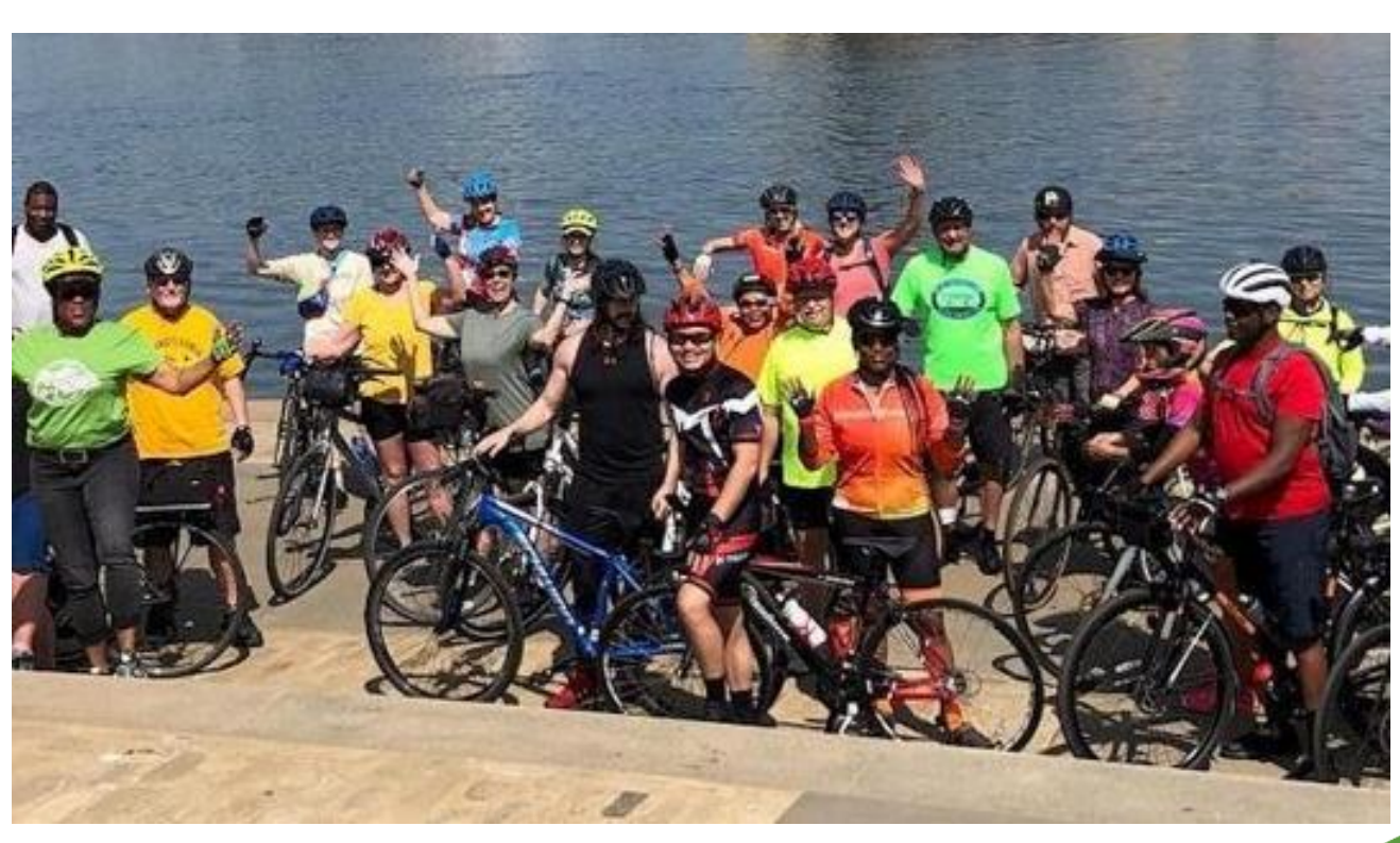
Photo of Celebrate Trails Day event in Pittsburgh PA