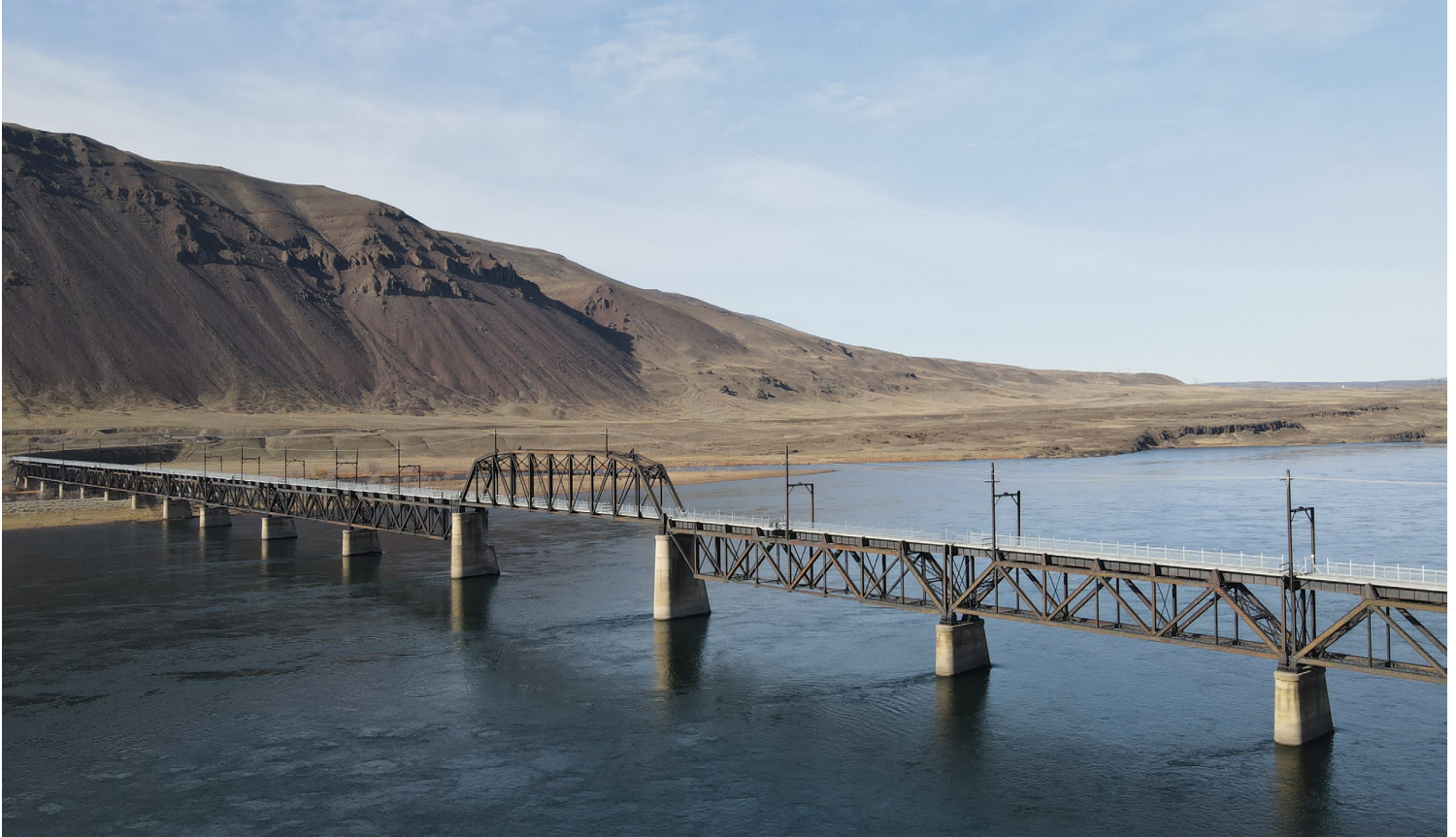
An aerial view of the completed Beverly Bridge over the Columbia River