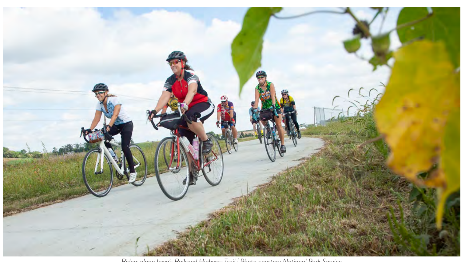
Riders along Iowa's Railroad Highway Trail | Photo courtesy National Park Service