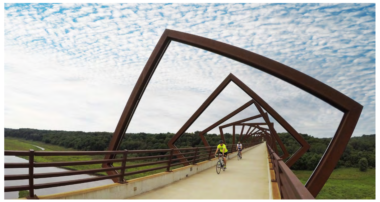
High Trestle Trail in Iowa