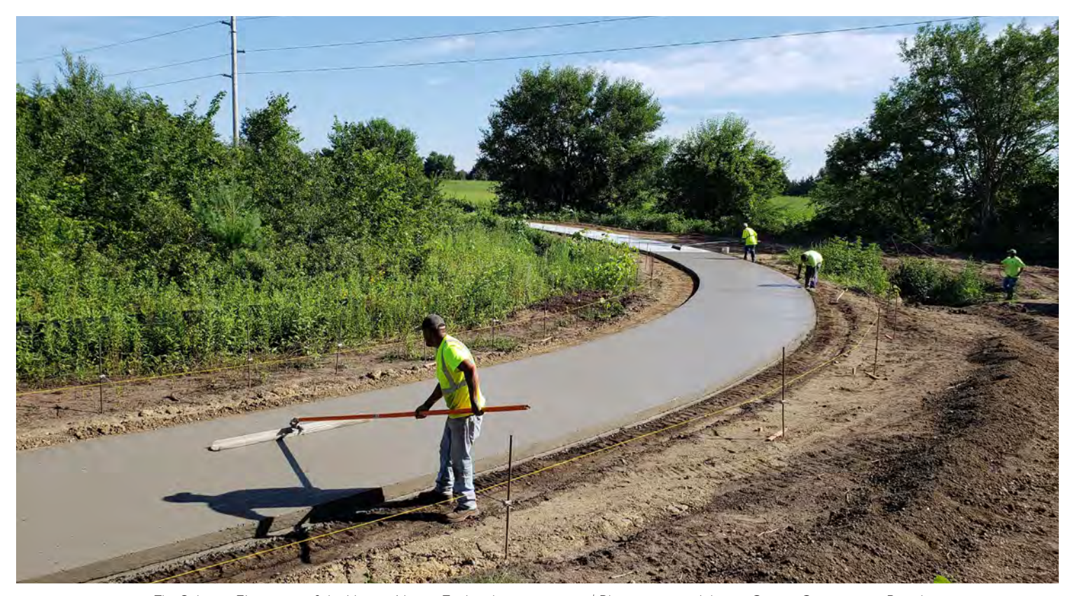
The Solon to Ely section of the Hoover Nature Trail under construction