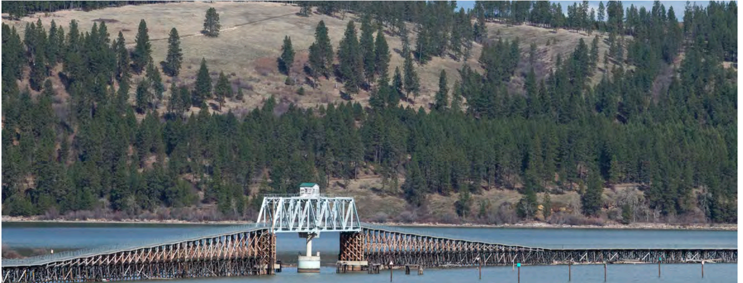
The Chatcolet Bridge carries the Trail of the Coeur d'Alenes across Lake Coeur d'Alene.