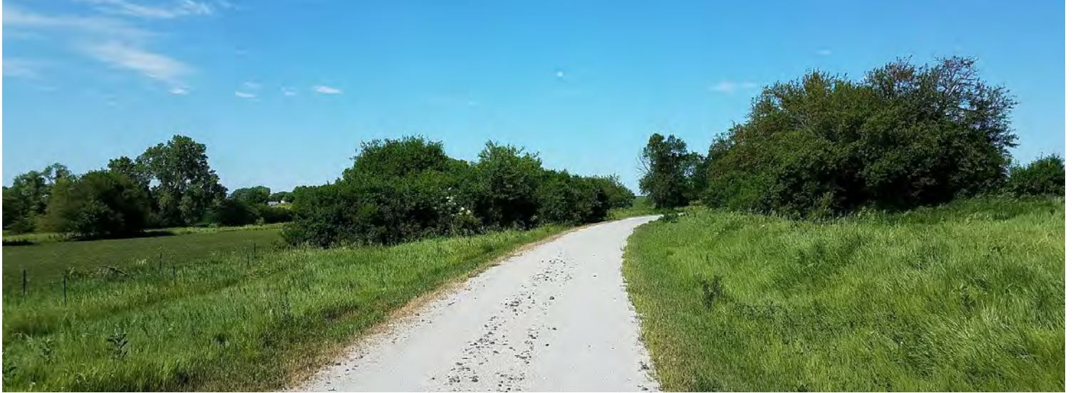
MoPac Trail East in Nebraska

The Turner Boulevard Trail connects to the Burt Street Trail at North 30th Street in Omaha. The Turner Boulevard Trail currently travels 2.2 miles. The Turner Boulevard Trail will host the Great American Rail-Trail for 2.1 miles, spanning the intersection of North 30th and Burt streets to Pacific Street at the Field Club of Omaha. The trail is a shared-use path that runs along the west side of North 30th Street and Turner Boulevard, winding past several parks and neighborhoods and ending at the Field Club of Omaha.