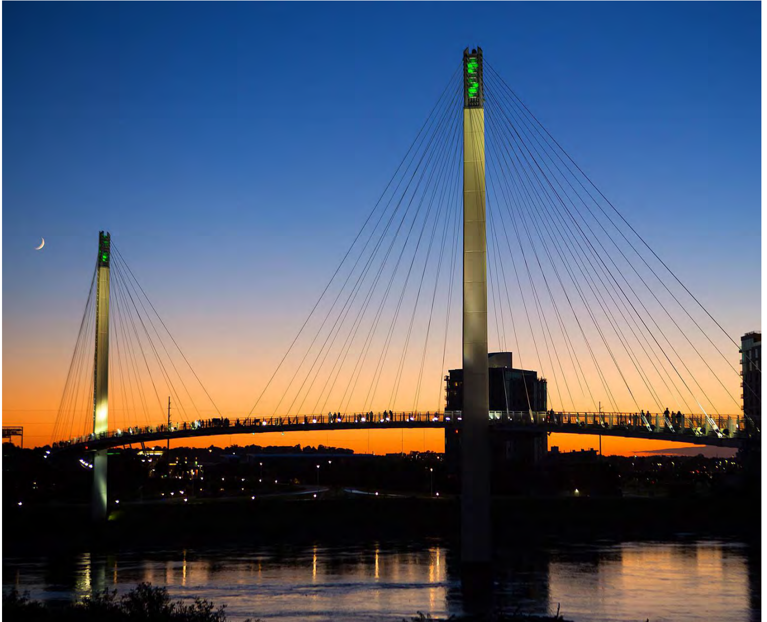
Bob Kerrey Pedestrian Bridge connecting Iowa and Nebraska