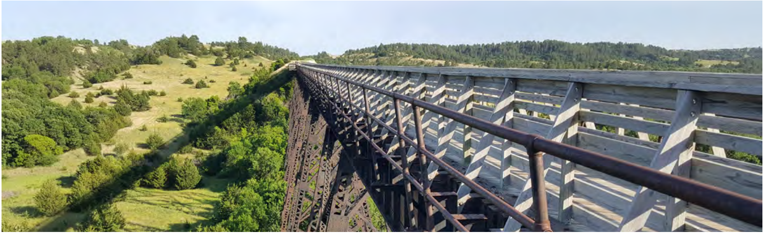
Cowboy Trail in Nebraska