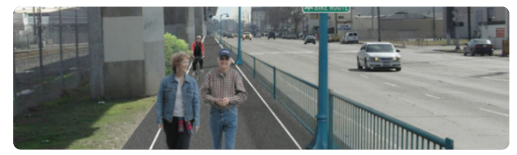
Rendering of the East Bay Greenway with a Class I bikeway (rail-trail)

Alameda CTC and Caltrans are the respective lead agencies for state and federal environmental clearance of the East Bay Greenway. Other project partners include the City of Oakland, the City of San Leandro, the City of Hayward, Alameda County, BART and AC Transit. The East Bay Greenway is one of 12 projects that the Bay Area