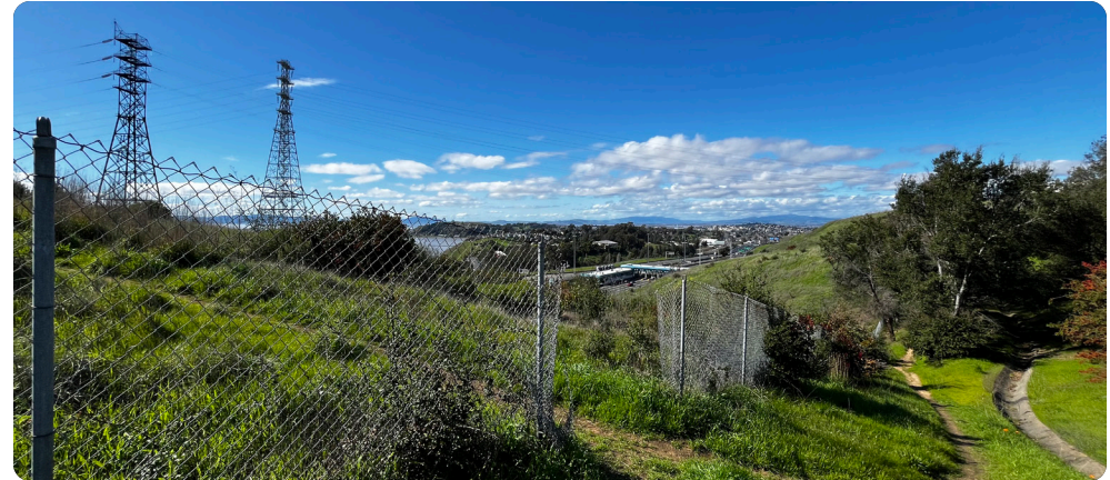
Looking west towards the Al Zampa Bridge

The Bay Area Trails Collaborative is a Rails-to-Trails Conservancy TrailNation™ project—a nationwide initiative to create model trail networks and ultimately connect the country by trail.