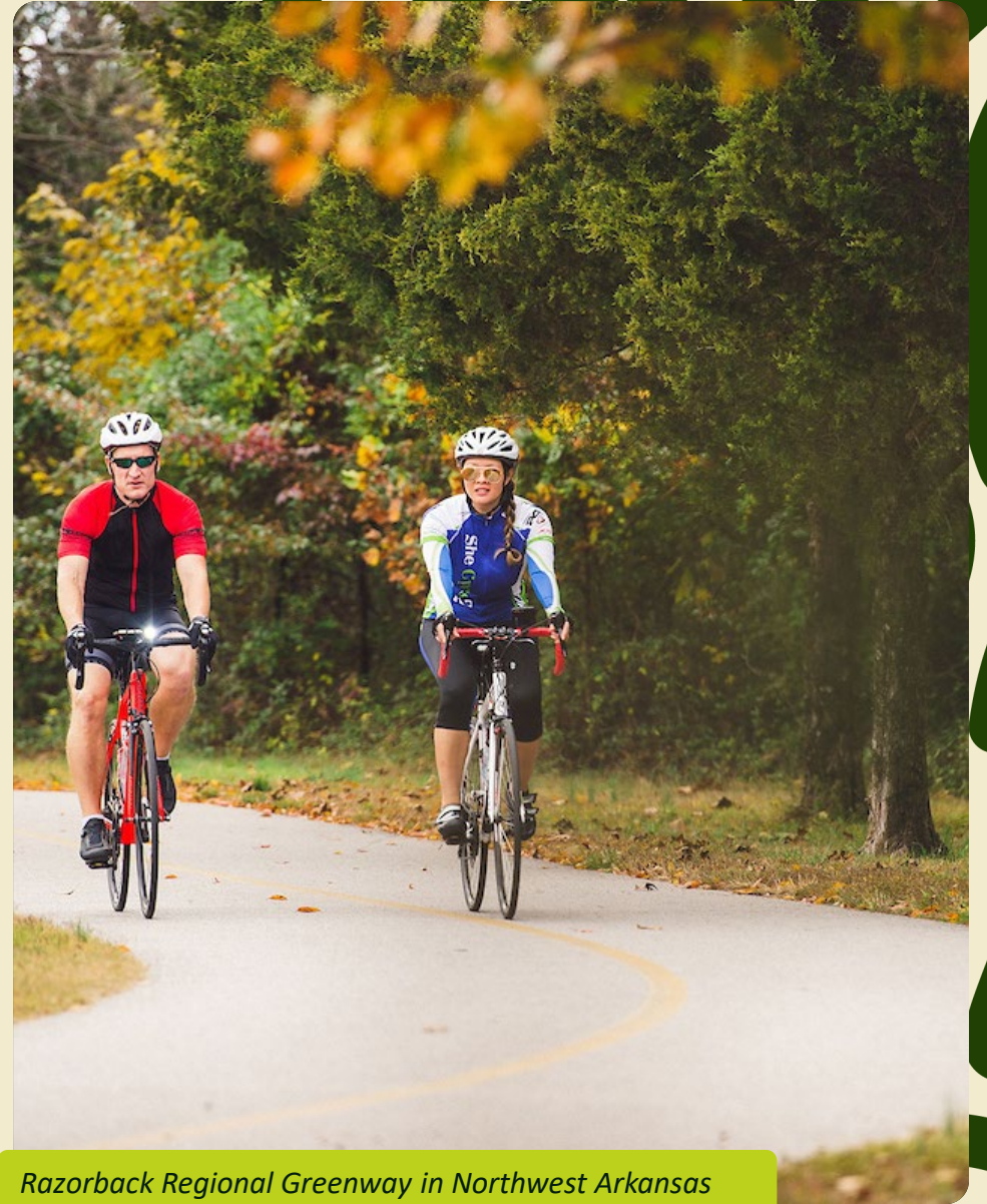
Razorback Regional Greenway in Northwest Arkansas