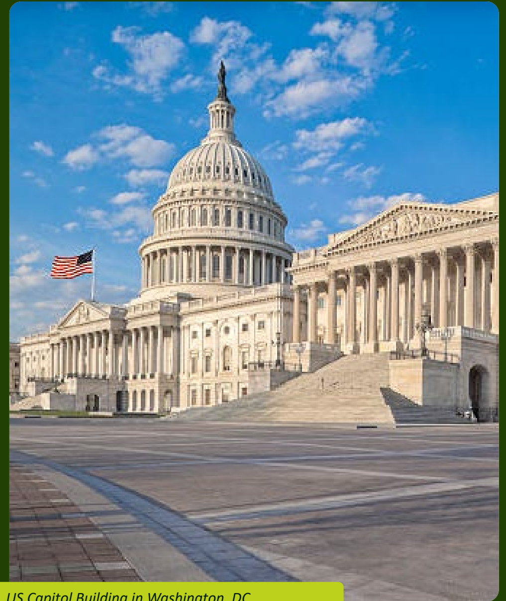
US Capitol Building in Washington, DC