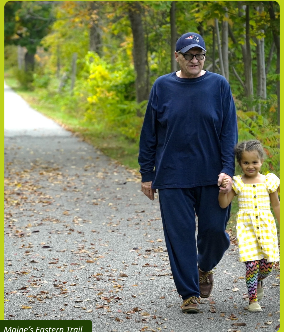
Maine's Eastern Trail

All ballot measures that RTC supported won handily