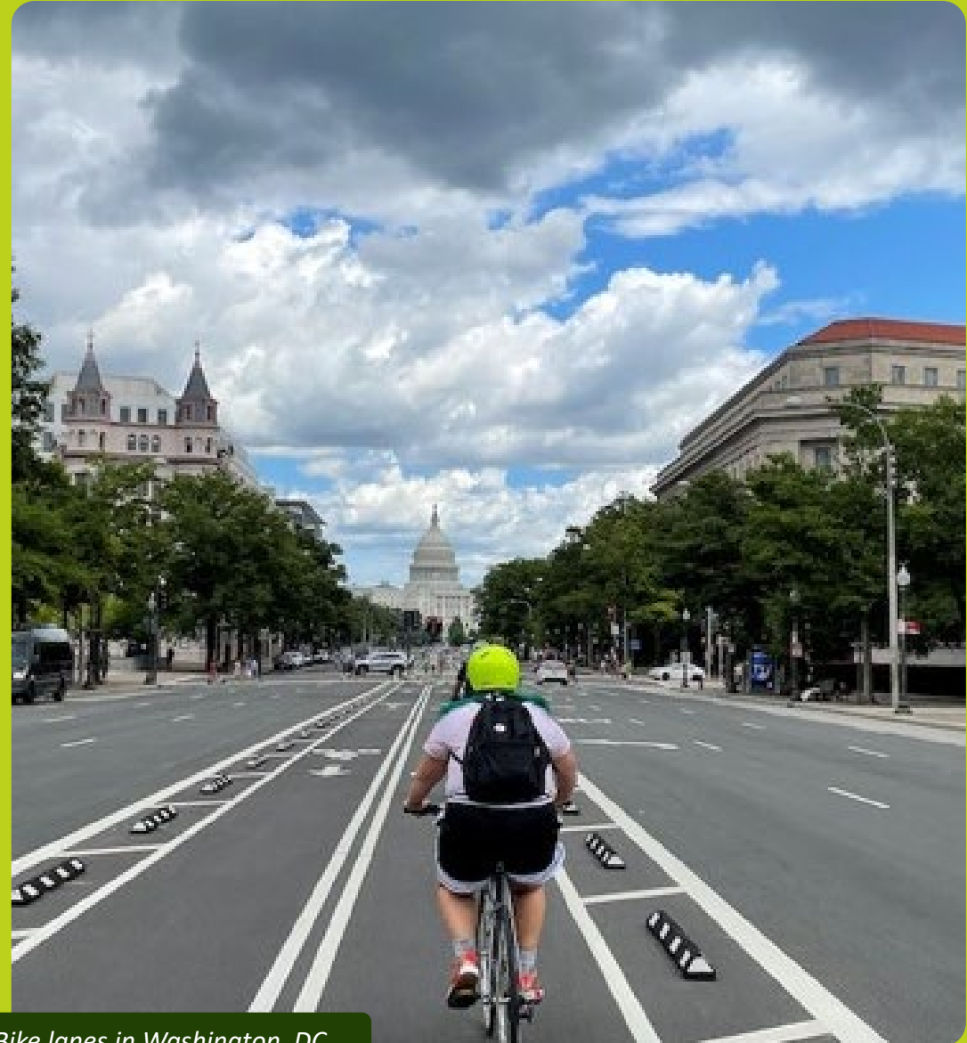
Bike lanes in Washington, DC