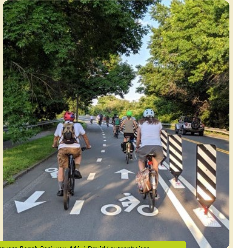
Revere Beach Parkway, MA