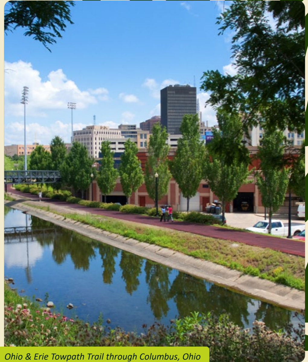
Ohio & Erie Towpath Trail through Columbus, Ohio