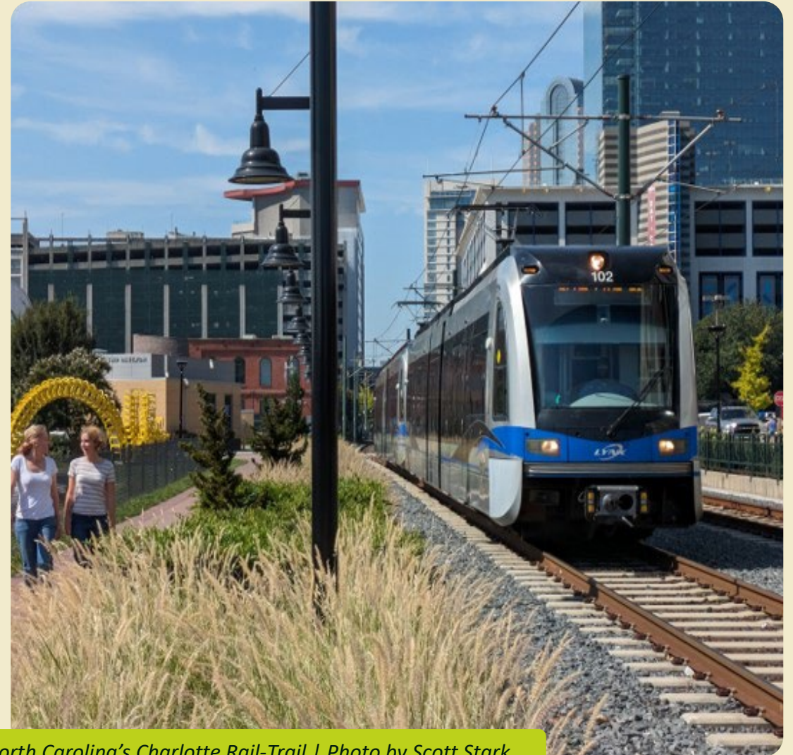
North Carolina's Charlotte Rail-Trail