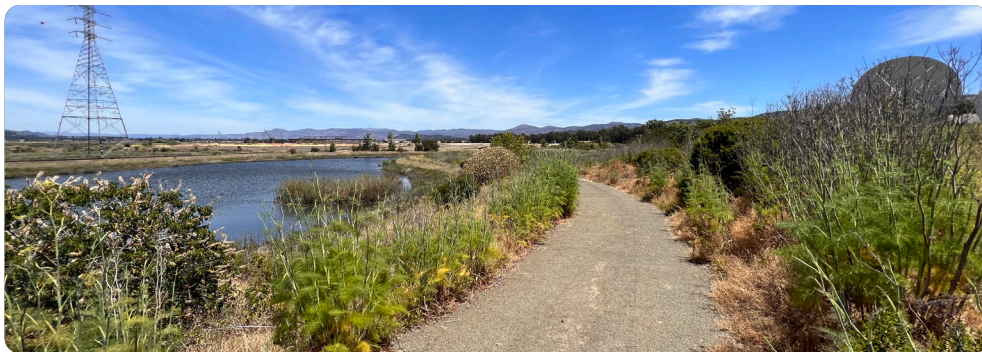
Napa Valley Vine Trail | Joe LaCroix