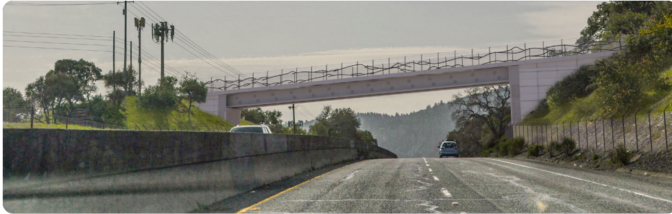
Rendering of Southern Overcrossing (AECOM)