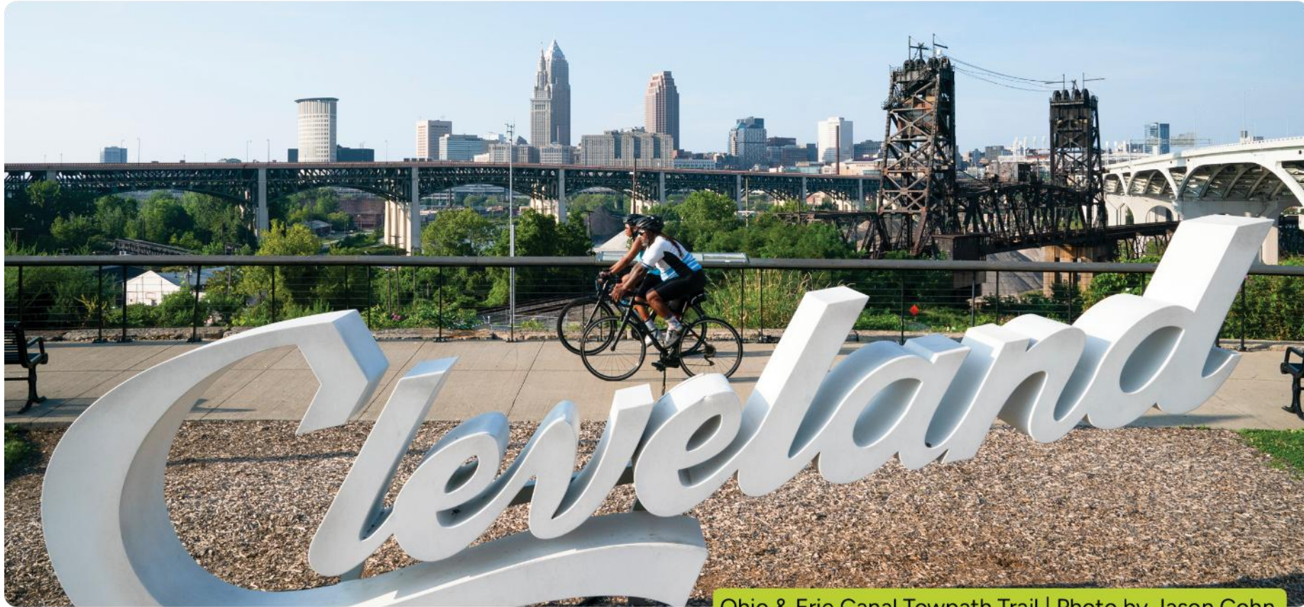
Ohio & Erie Canal Towpath Trail

Register Today: railstotrails.org/trailnation